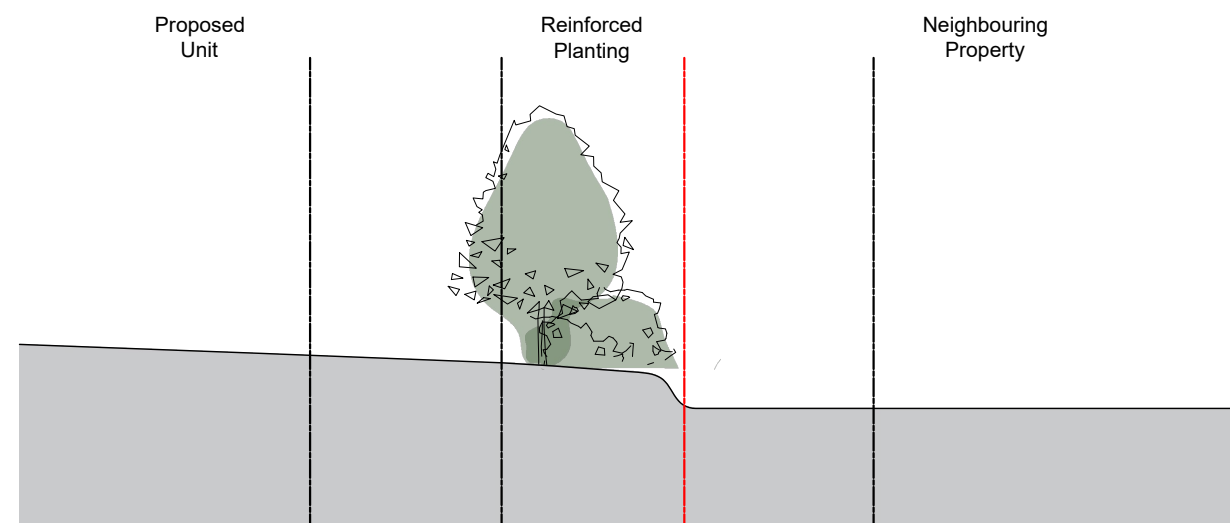
Cross Section B-B