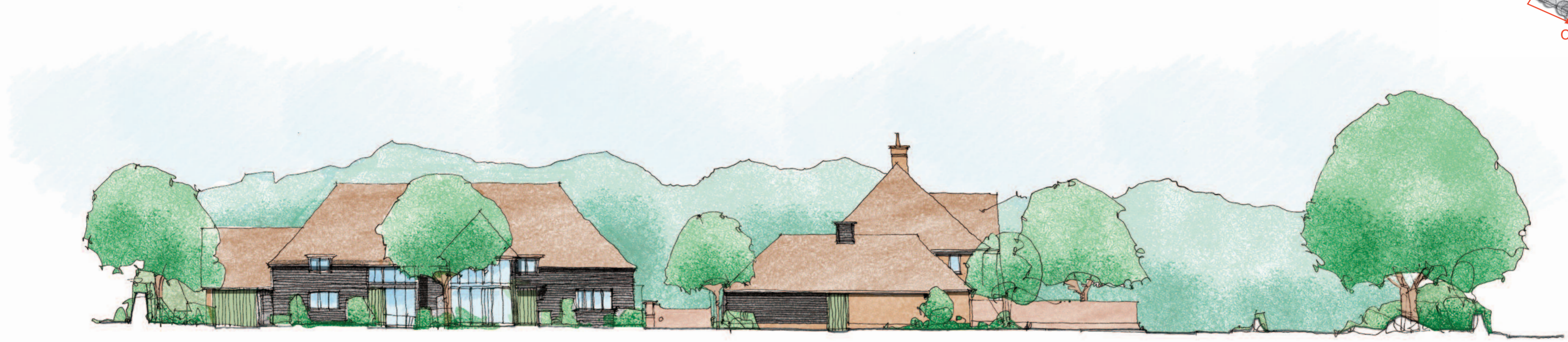
Section A-A 5 4 3