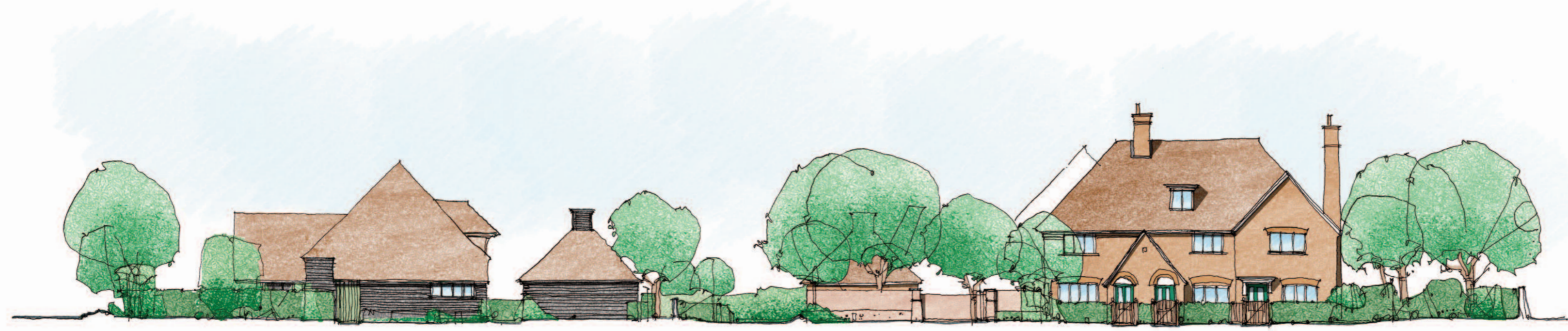
Section B-B 8 1 2 3