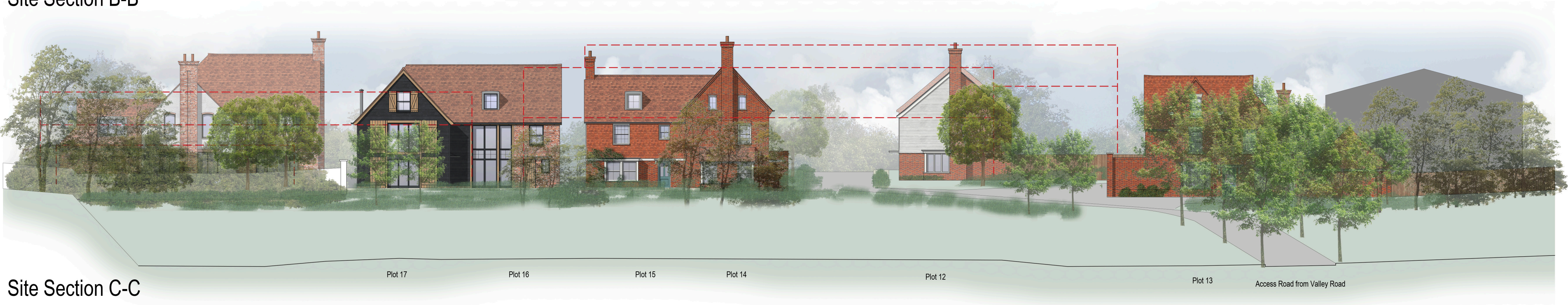
Site Section C-C