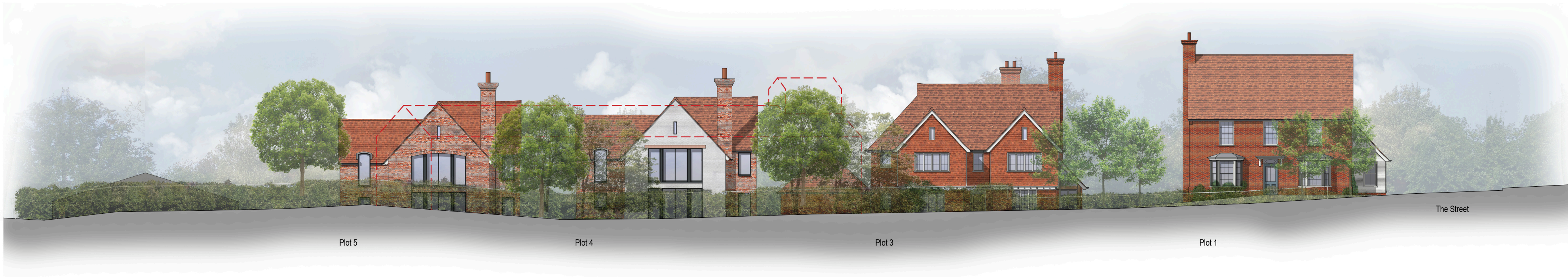
Site Section A-A