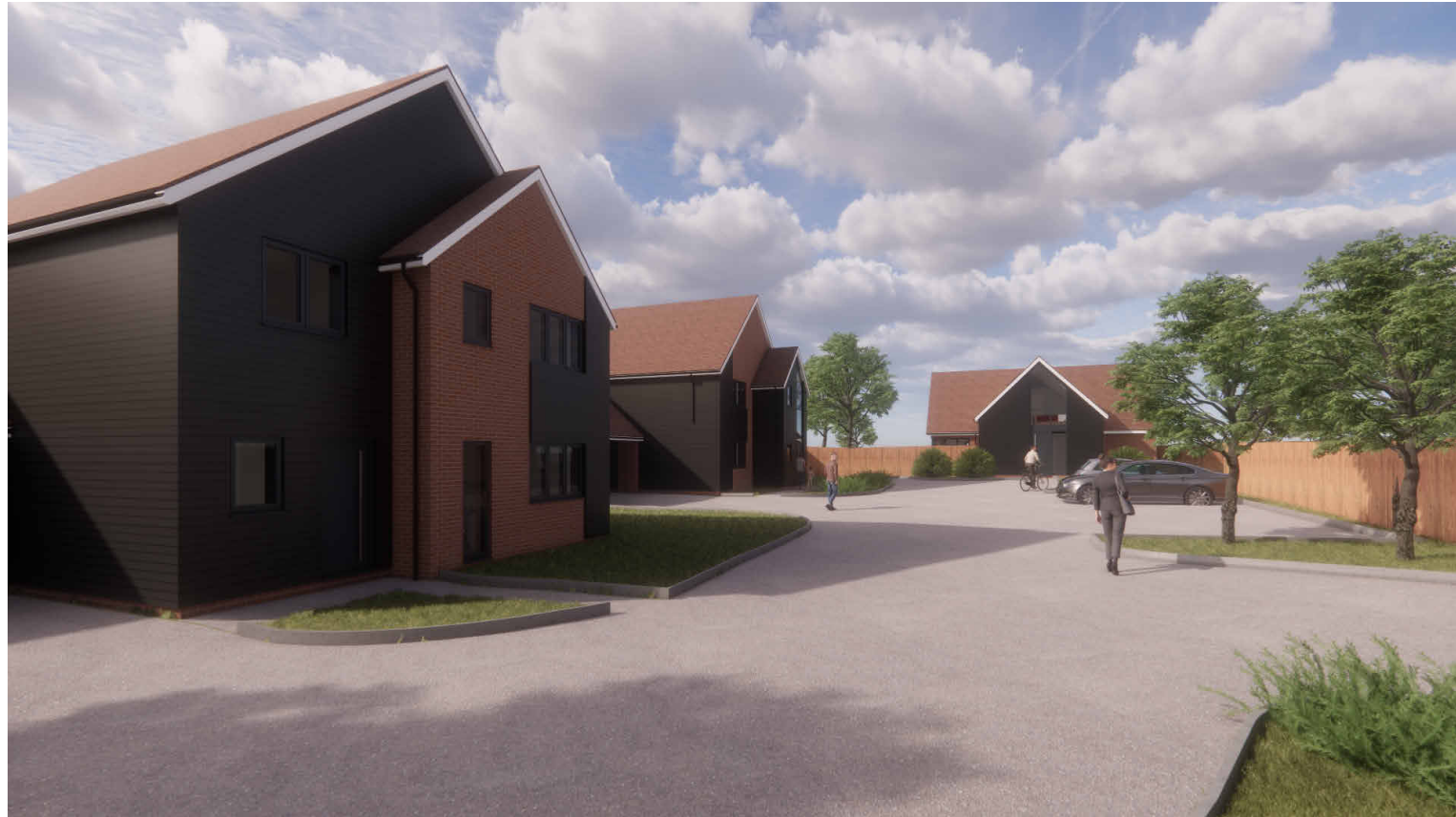
3D Perspective View 02