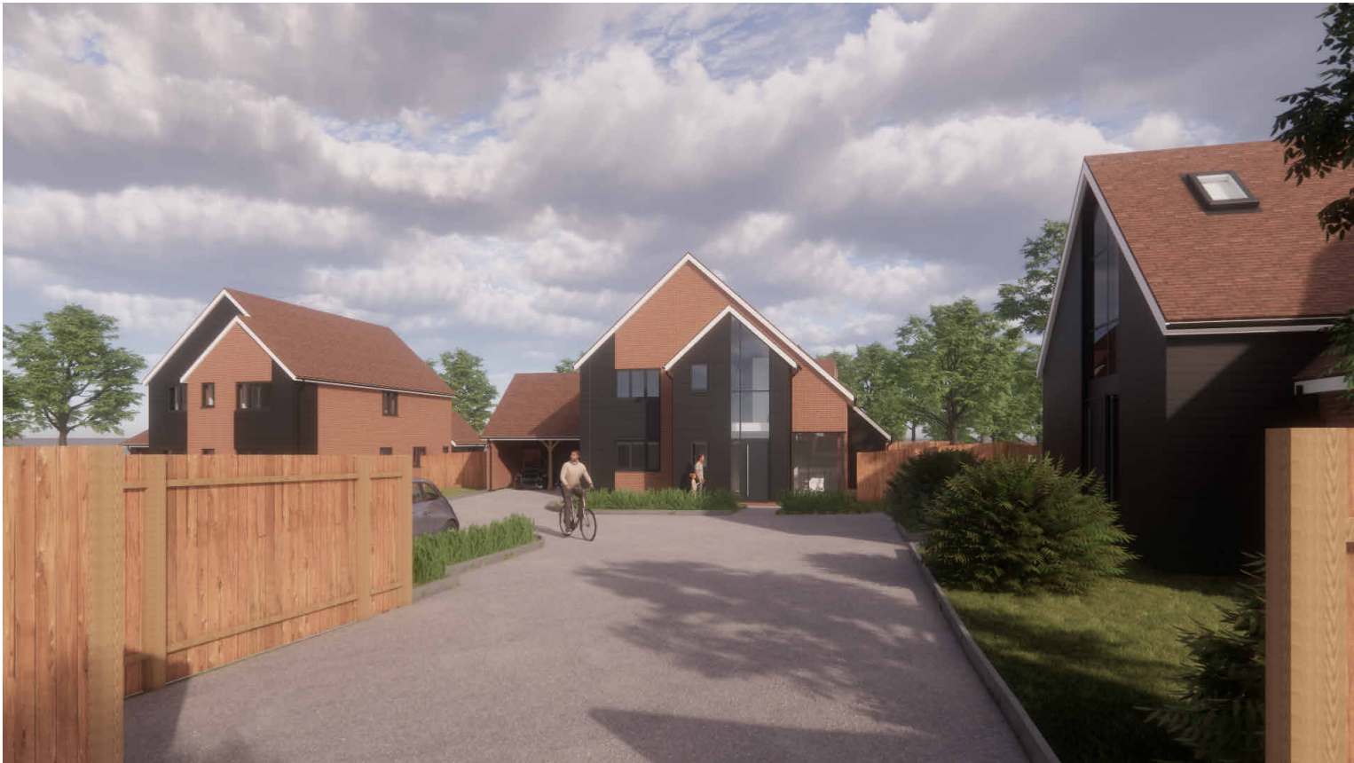
3D Perspective View 01