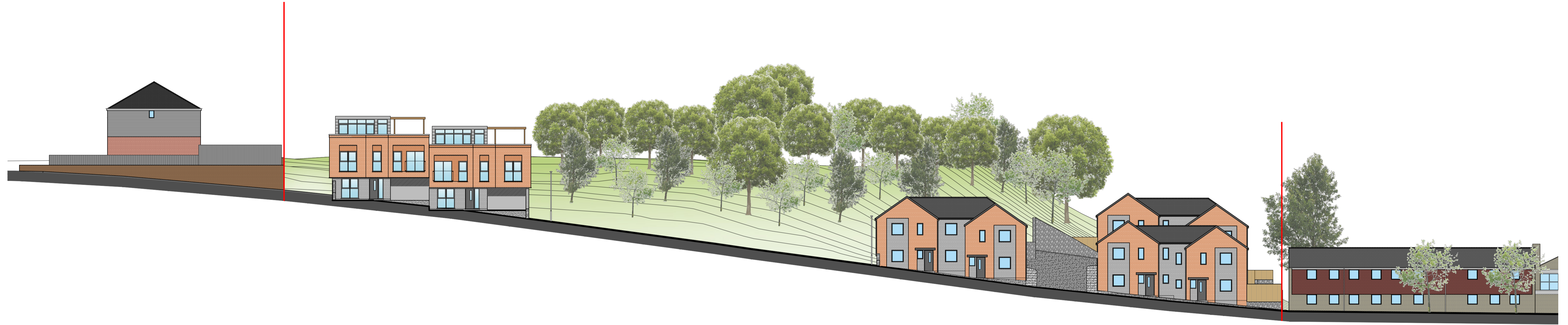
Proposed Romney Avenue Elevation 1:200