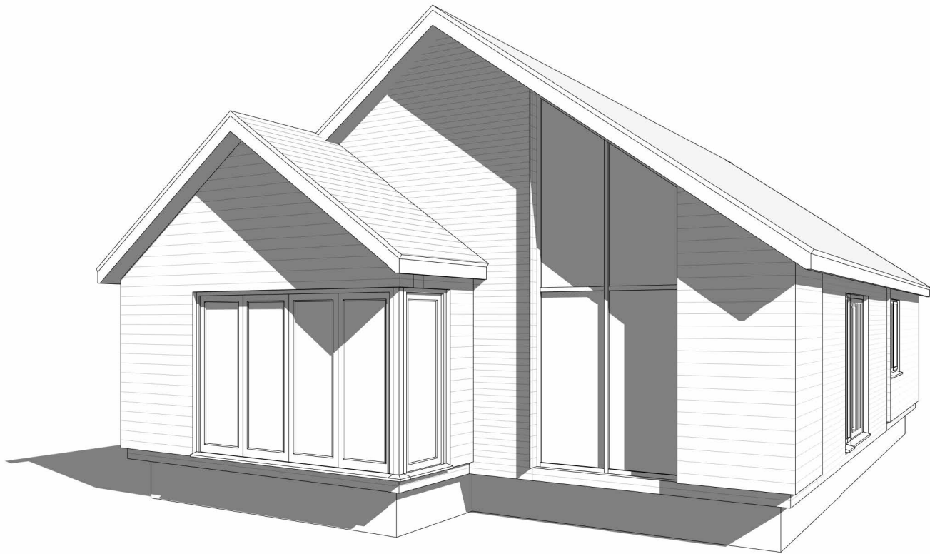
3D View 1