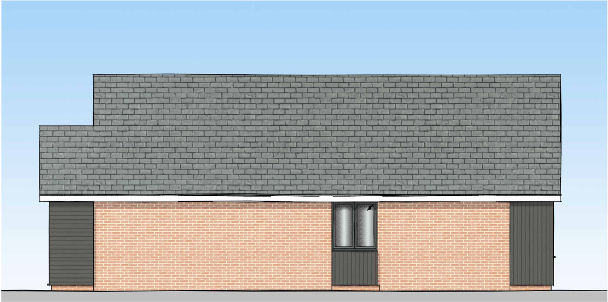
Side Elevation 1 : 100