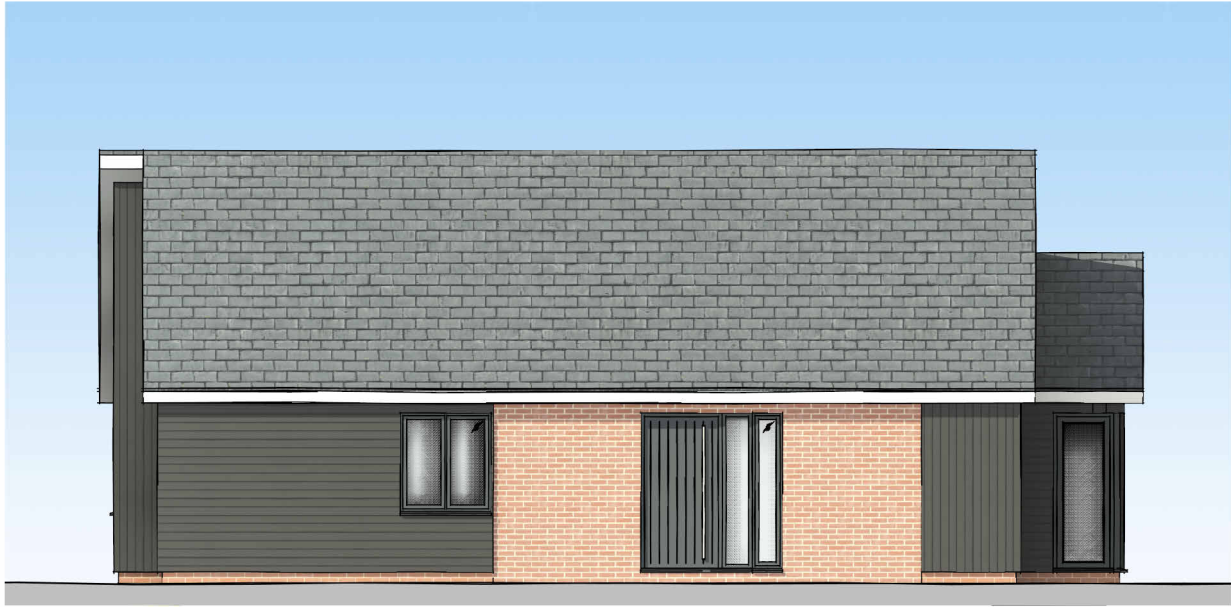
Side Elevation 1 : 100