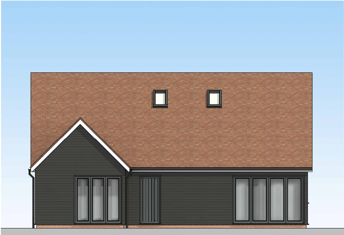
Side Elevation 1 : 100