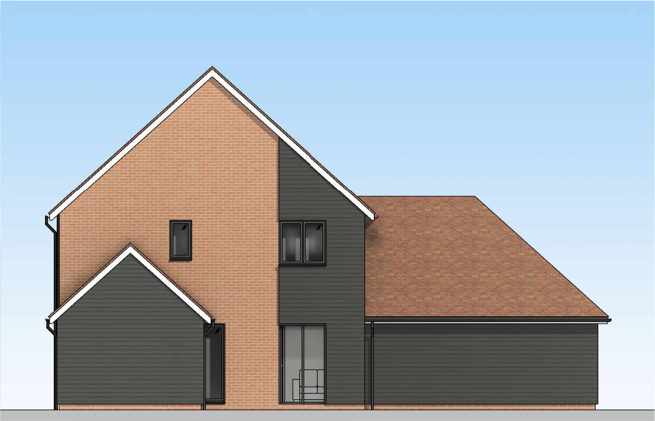
Rear Elevation 1 : 100