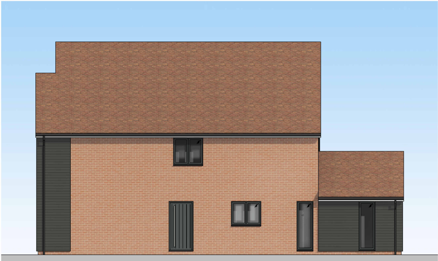
Side Elevation 1 : 100