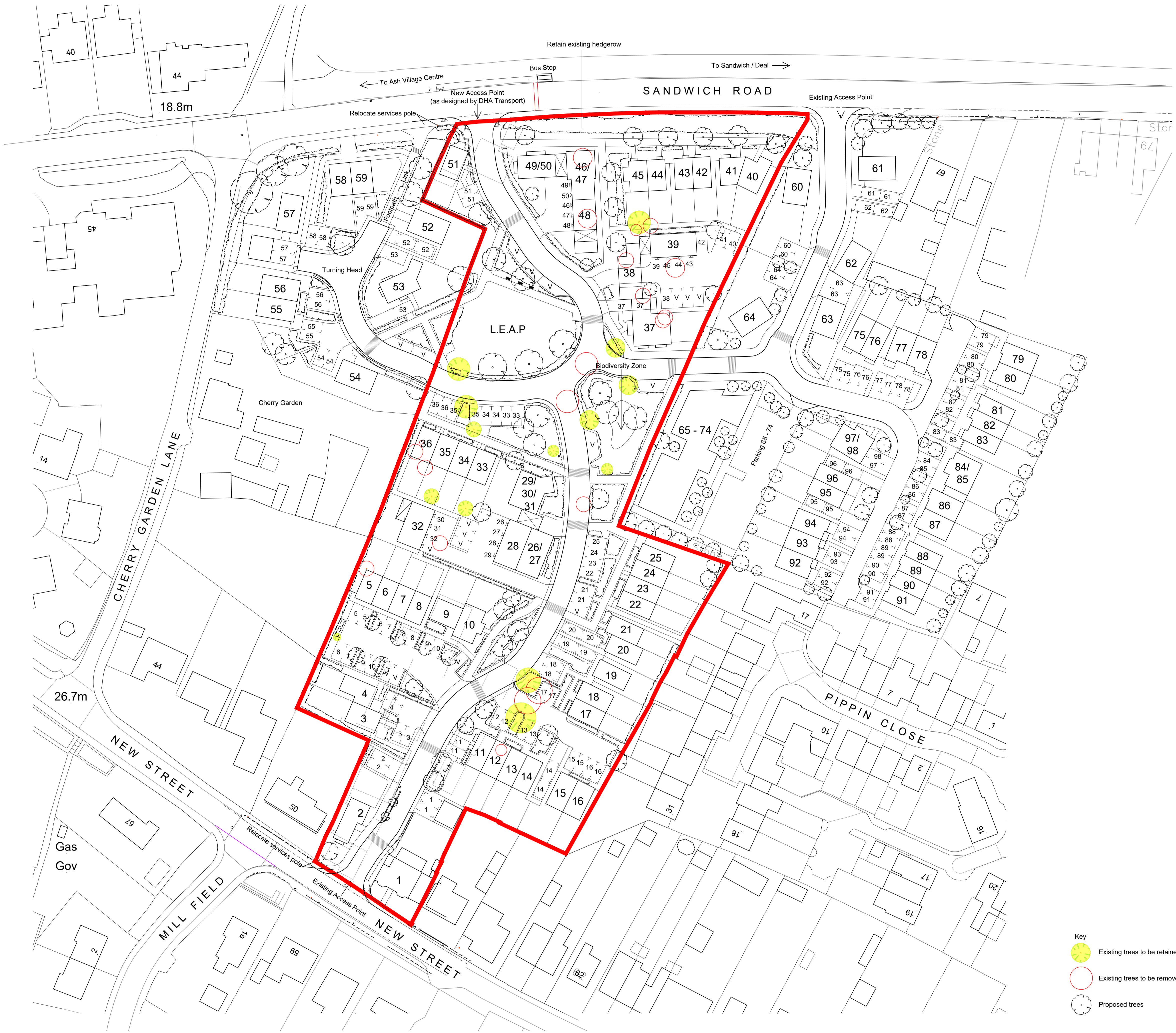
Proposed Site Plan 1:500