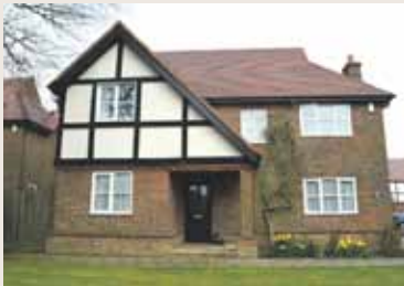
Waltham • Guide £475,000 Exclusive detached family home, secluded rear gardens, double garage and further parking. EPC Rating D