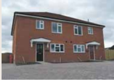
Mersham • Guide £325,000 each 2 brand new 3 bed semi-detached houses, gardens and off-road parking for 3 cars. EPC Rating C