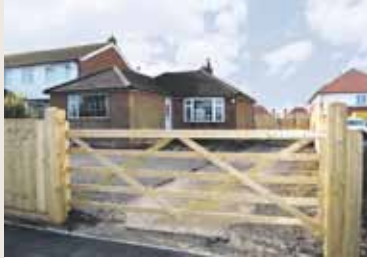
Aldington • Guide £269,000 2 bed bungalow with planning permission for conversion to 4 bed detached chalet bungalow. EPC Rating G