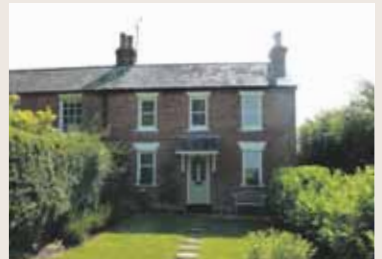
Warehorne • Guide Price £395,000 Double fronted period cottage, 3 double bedrooms, en-suite shower, off-road parking. EPC Rating E