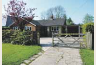
Stelling Minnis • Guide £379,950 Detached 3 bed bungalow, garden and stable. Garage, off-road parking. Access to The Minnis. EPC Rating D