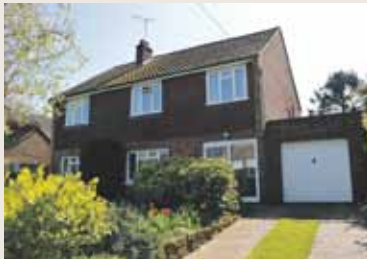
Mersham • Guide £425,000 Detached 5 bed family home, delightful front and rear gardens, garage and off road parking. EPC Rating TBA