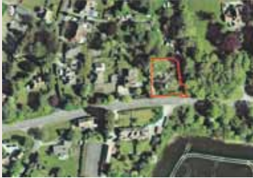
Land at Challock • Guide £175,000 Best and final offers by 24/4/15 midday. Building plot with permission for 3 bed detached bungalow.