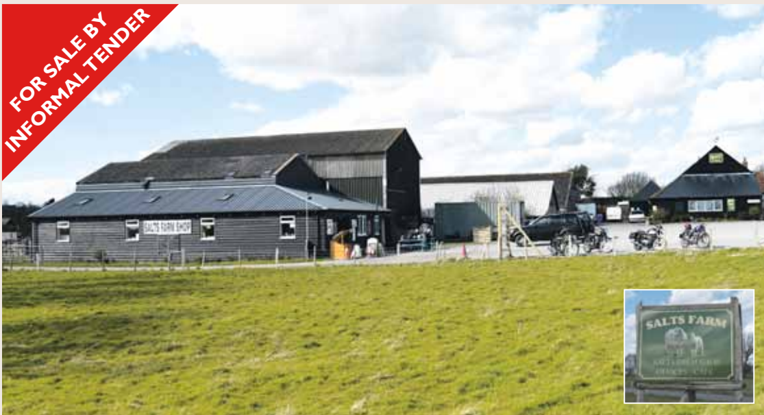
Rye • East Sussex For Sale by Informal Tender closing Friday 12 June 2015