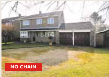
Charing • Guide £540,000 Executive detached family house, large south facing gardens, double garage and conservatory. EPC Rating D