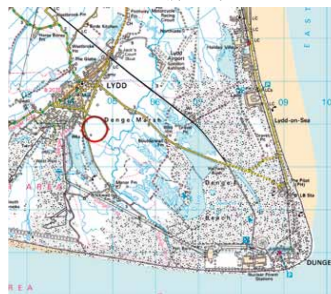
Hobbs Parker Property Auction - Wed 14 May 2014 7