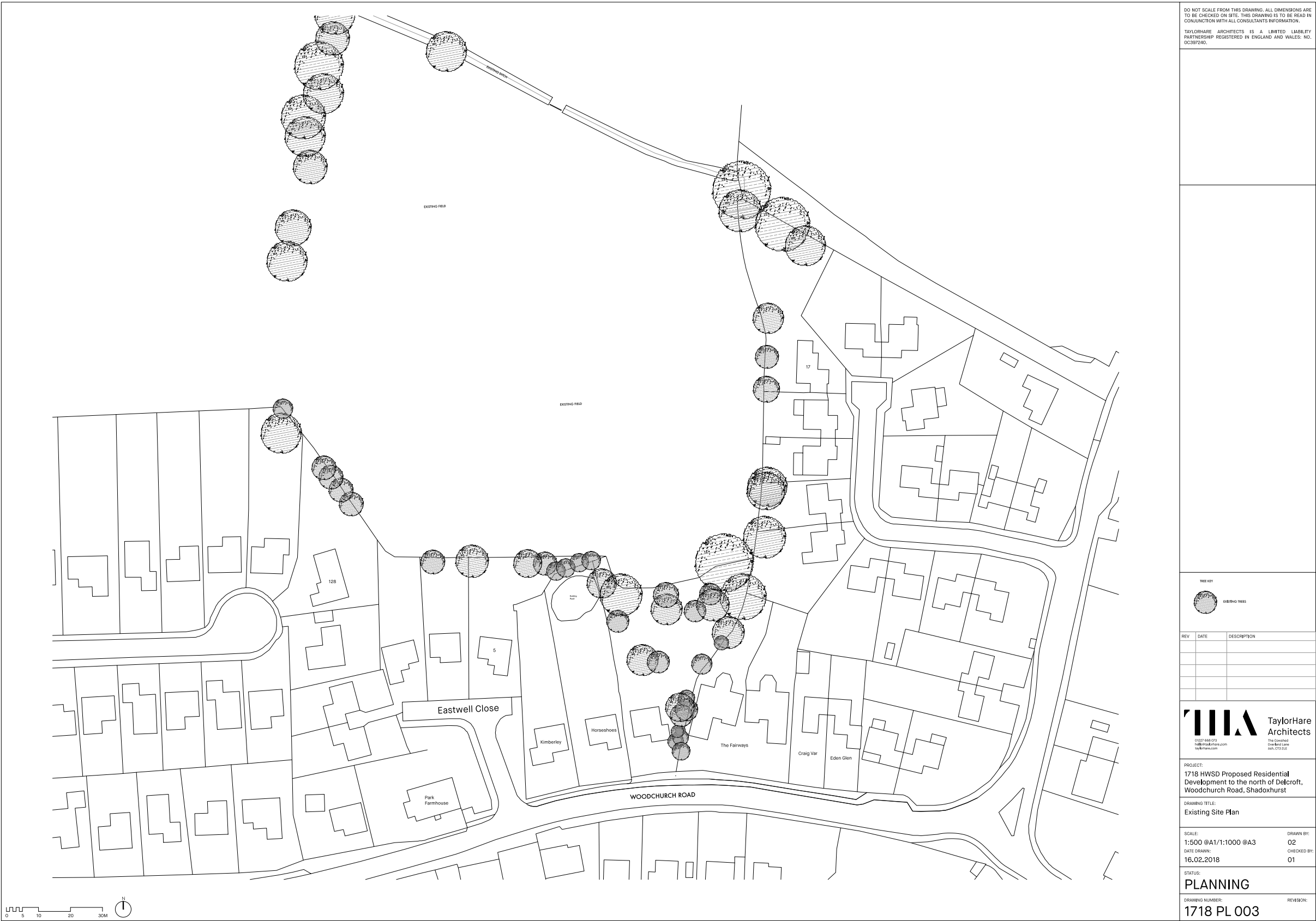
Above: Drawing No. 1718 HWSD PL 003 Existing Site Plan