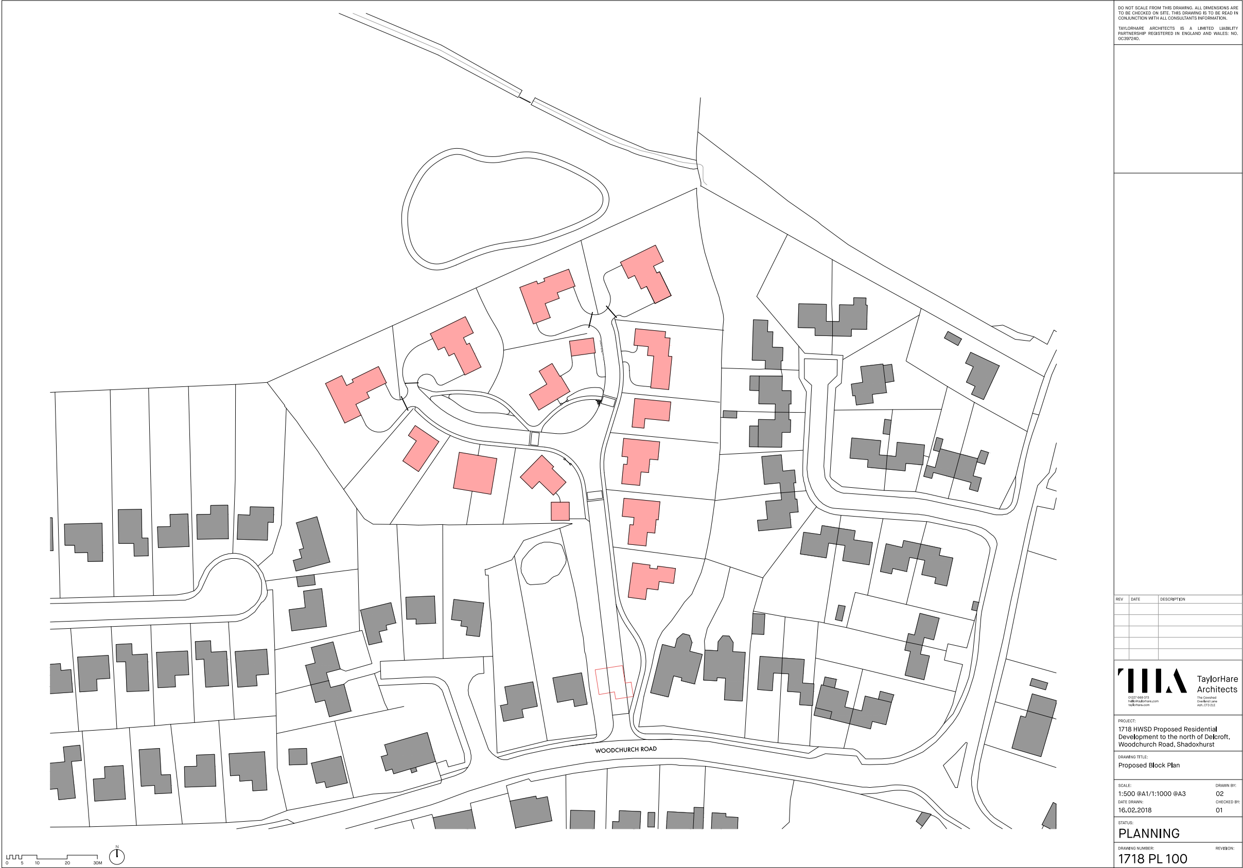
Above: Drawing No. 1718 HWSD PL 100 Proposed Block Plan