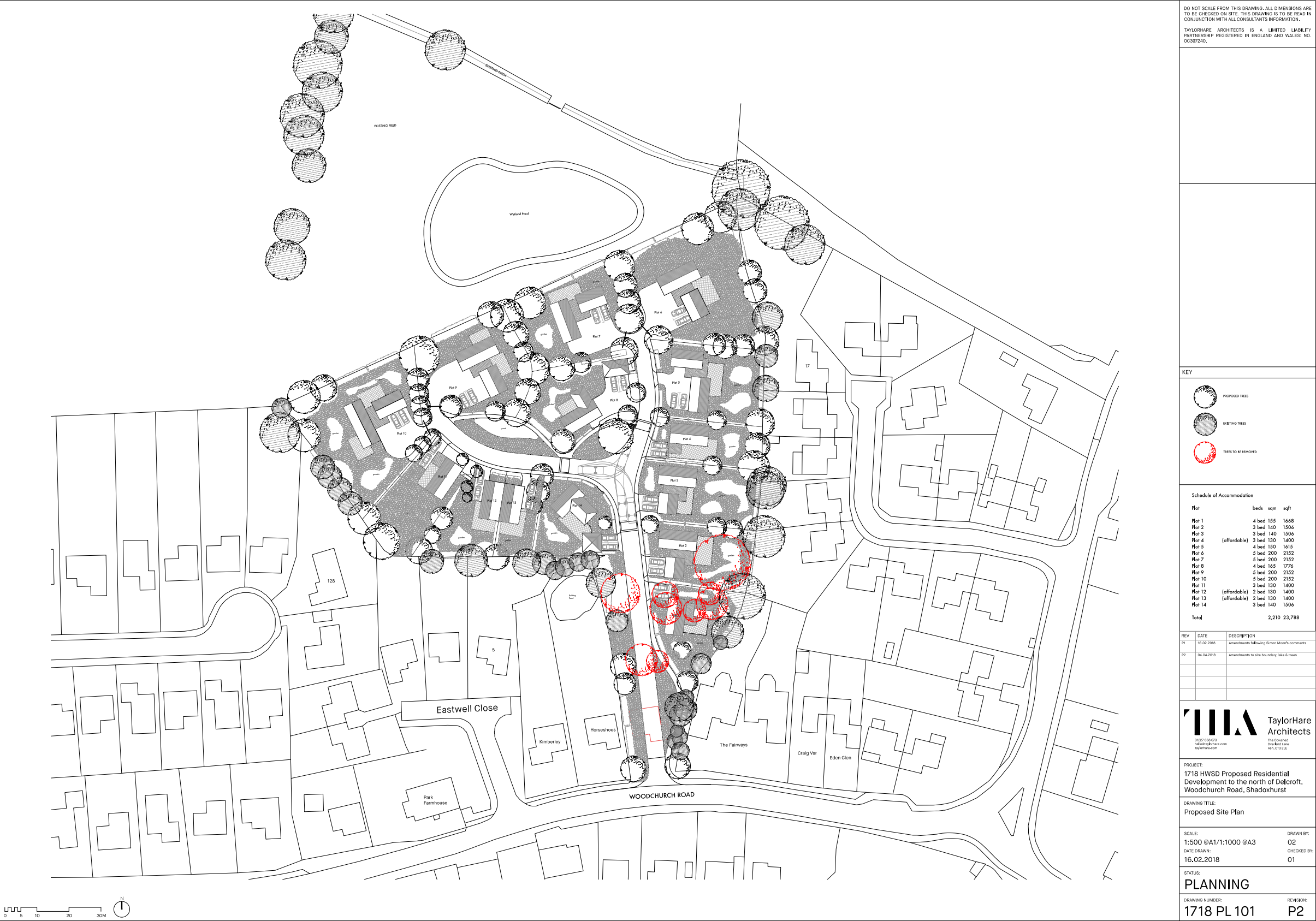
Above: Drawing No. 1718 HWSD PL 100 Proposed Site Plan