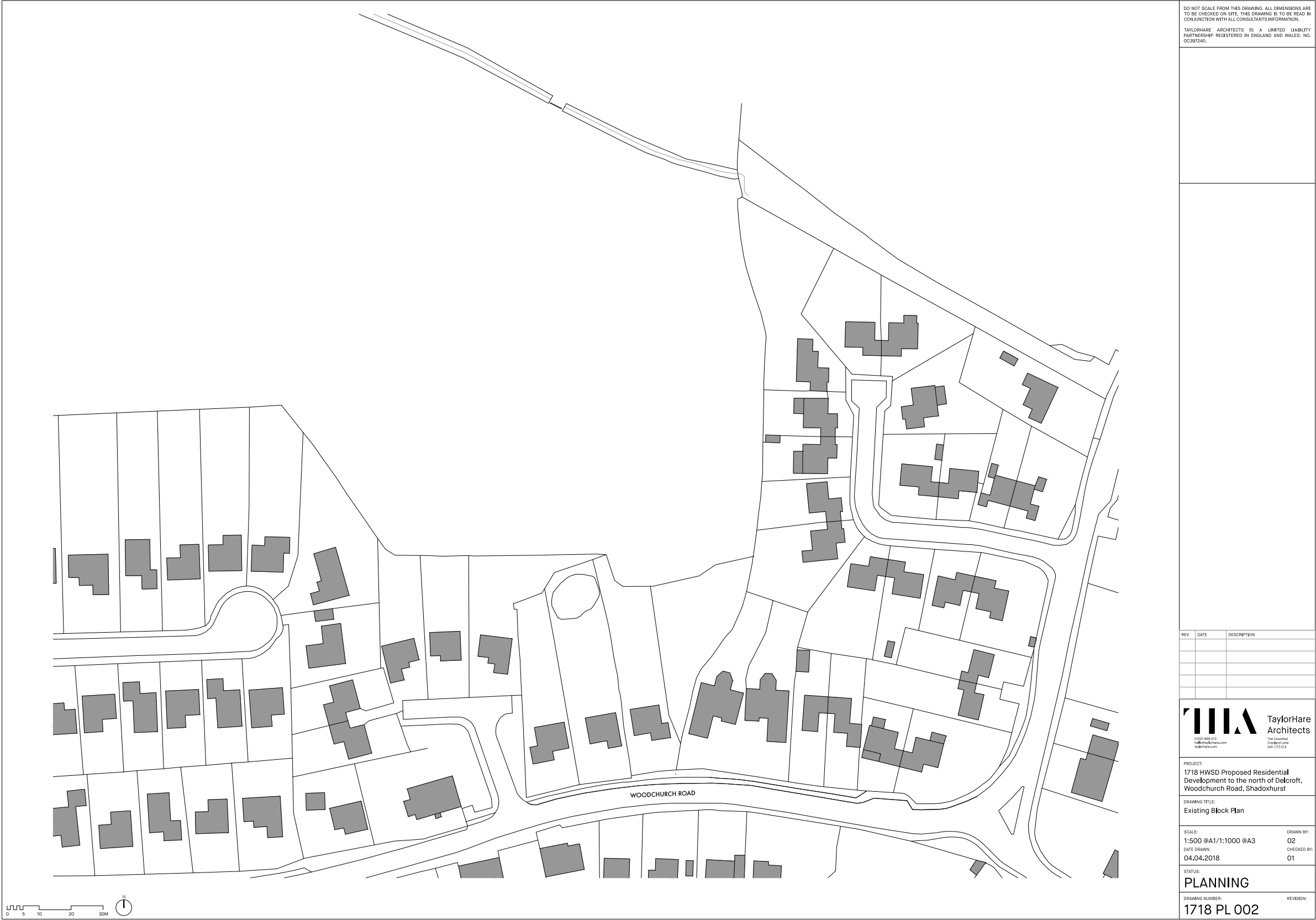
Above: Drawing No. 1718 HWSD PL 002 Existing Block Plan