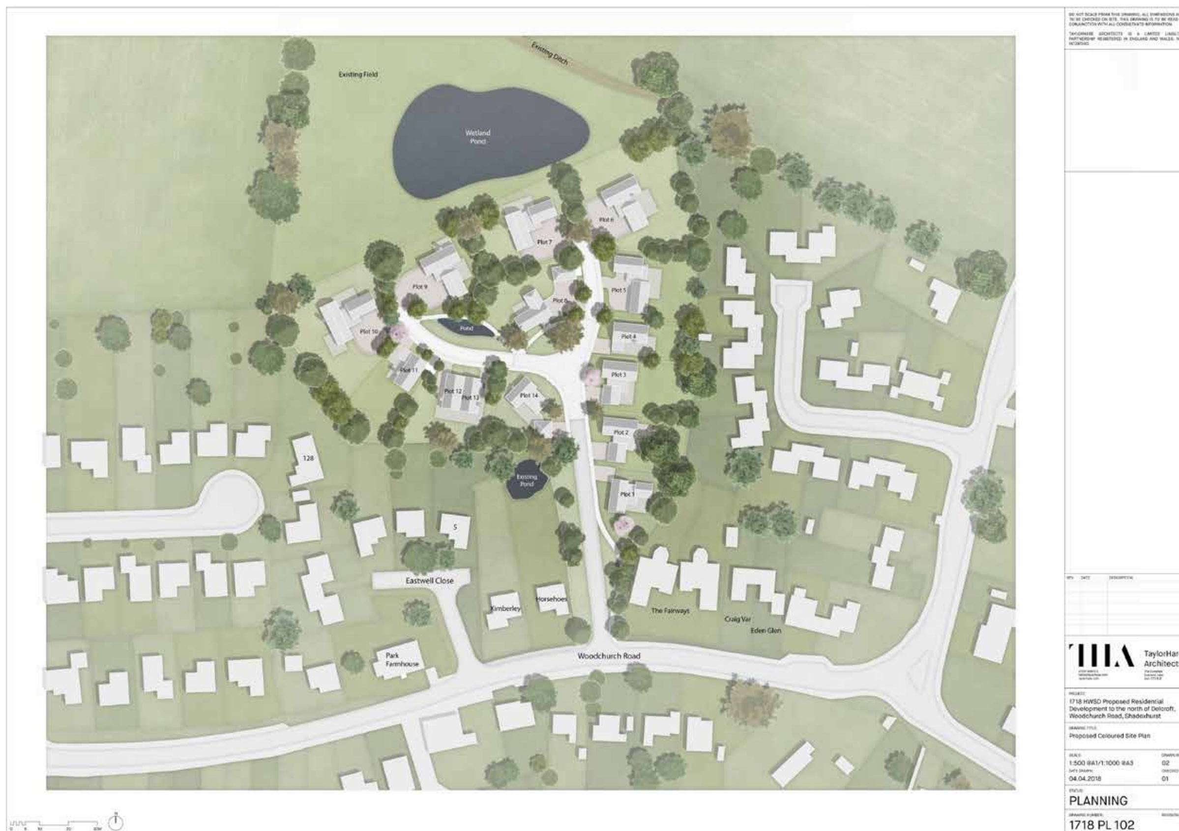
Above: Drawing No.1718 HWSD PL 101 Proposed Coloured Site Plan