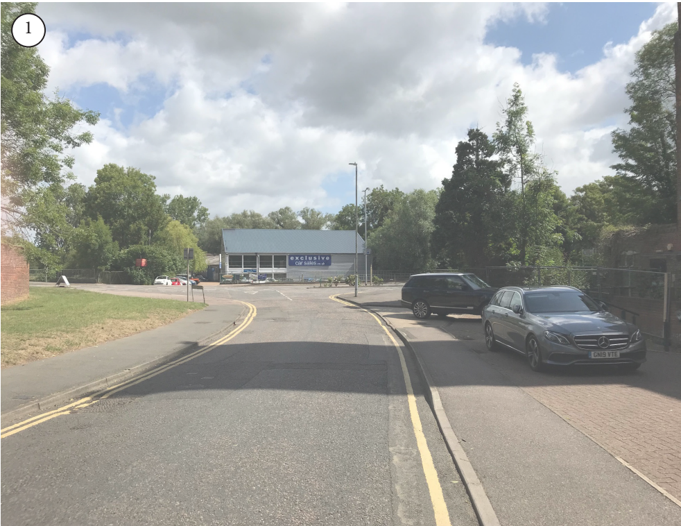
VIEW FROM SITE ENTRANCE LOOKING IN A NORTH EASTERLY DIRECTION.