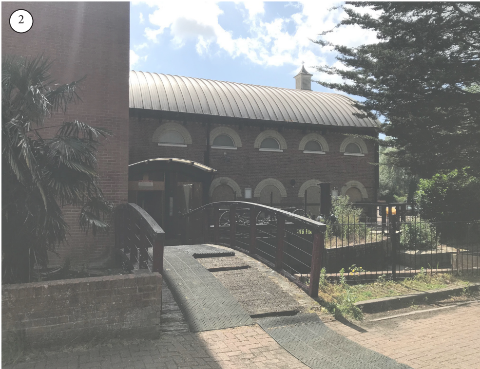
VIEW OF EXISTING PEDESTRIAN ENTRANCE TO BUILDING.