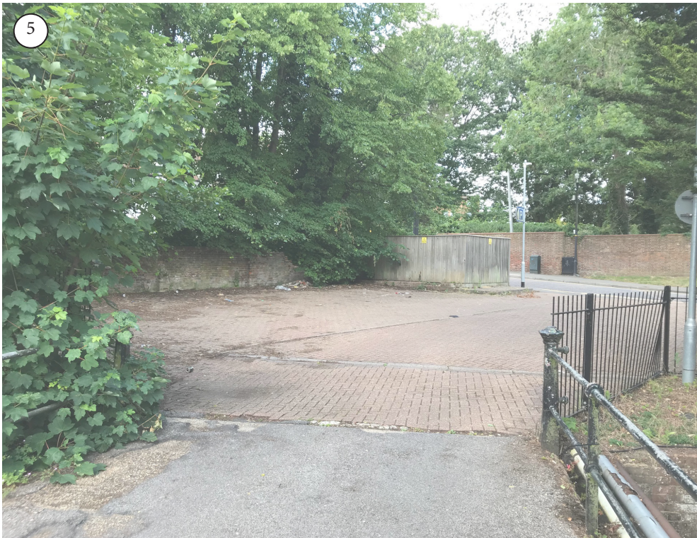
VIEW LOOKING NORTH AT CAR PARK ENTRANCE OFF EAST HILL.