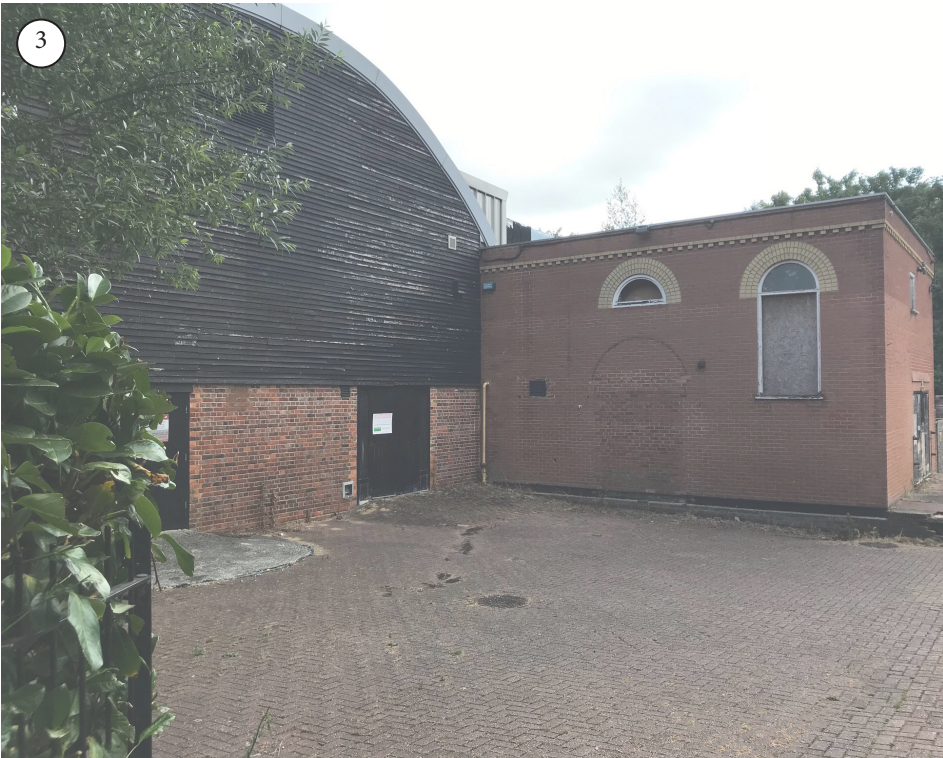
VIEW FROM CAR PARK LOOKING TOWARDS REAR OF EXISTING MILL BUILDING