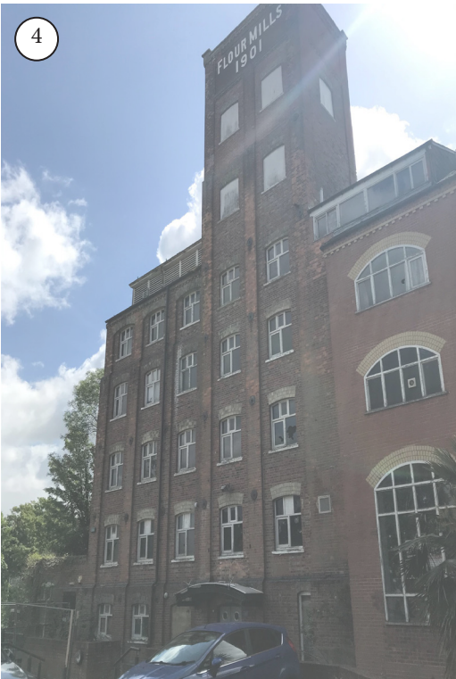
VIEW LOOKING AT THE EXISTING WEST FACADE.