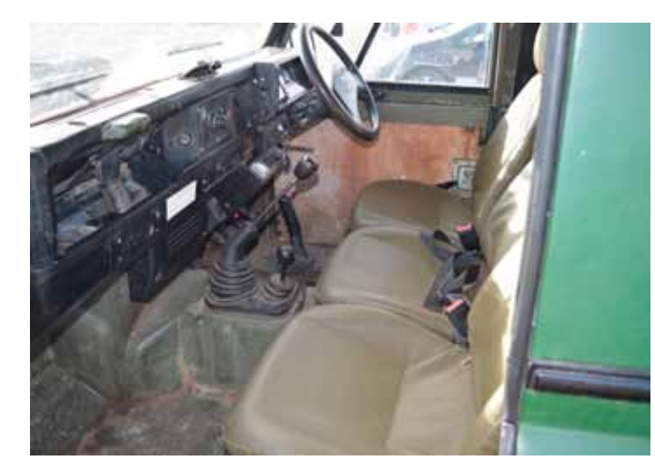
26 Hobbs Parker Classic Car Auction - Friday 2nd November 2018