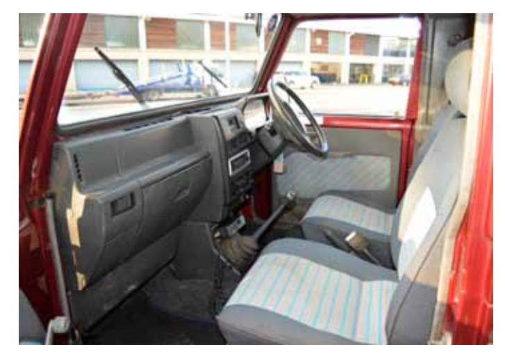
32 Hobbs Parker Classic Car Auction - Friday 2nd November 2018