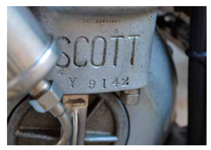
22 Hobbs Parker Classic Car Auction - Friday 2nd November 2018