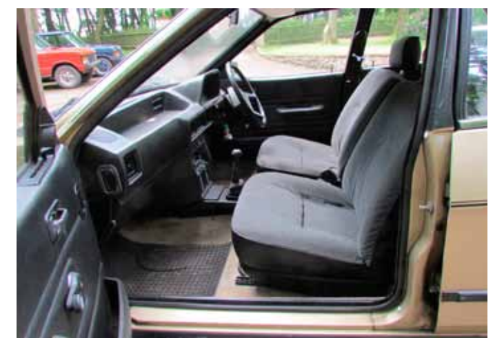
34 Hobbs Parker Classic Car Auction - Friday 2nd November 2018