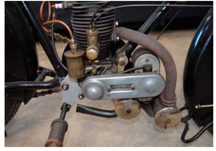
LOT 937 1927 Scott Super Squirrell 596 Guide: £8,000-£9,000 BF 7313