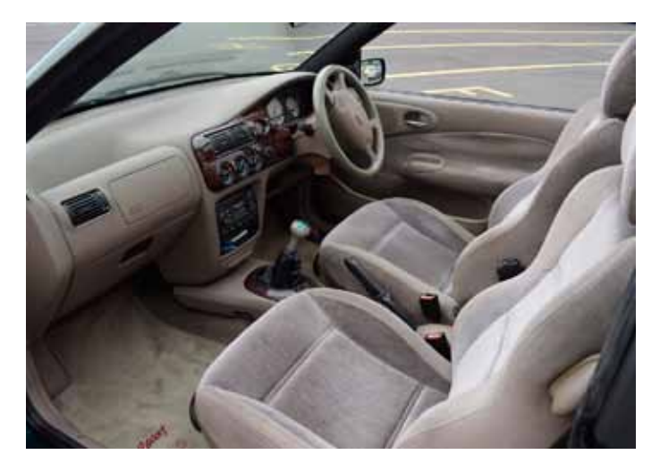
18 Hobbs Parker Classic Car Auction - Friday 2nd November 2018