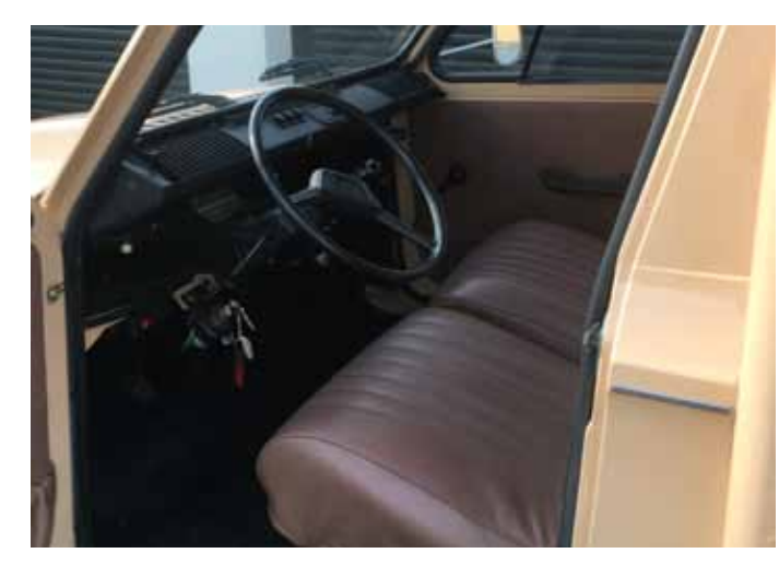
28 Hobbs Parker Classic Car Auction - Friday 2nd November 2018