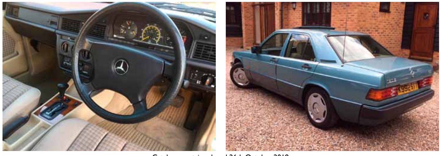
Catalogue entries closed 26th October 2018