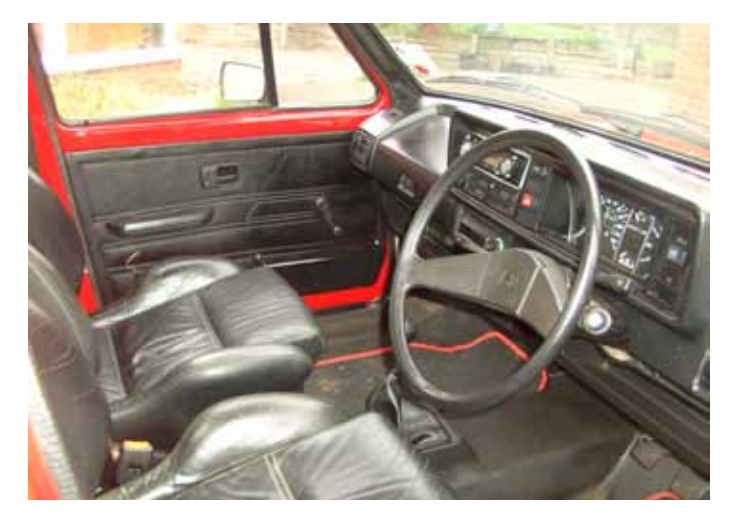
12 Hobbs Parker Classic Car Auction - Friday 2nd November 2018

• First registered in 1990 • MOT until 11/04/2019