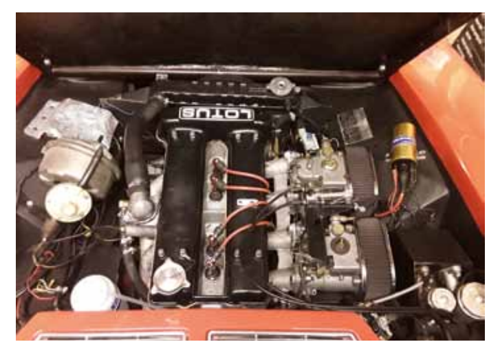
8 Hobbs Parker Classic Car Auction - Friday 2nd November 2018

• Saloon • Red • Petrol • Manual • 1558cc • 91,500 miles • Private sale, recent new parts include, washer bottle and pipe, 2 top ball joints, track rod ends and a service • The car has a Spyder chassis, solid drive shafts, electronic ignition and electric fan with adjustable switch • First registered in 1971 • MOT until 16/04/2019