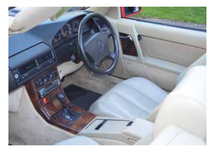
14 Hobbs Parker Classic Car Auction - Friday 2nd November 2018