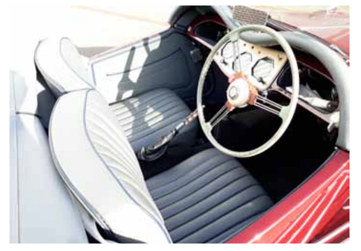
10 Hobbs Parker Classic Car Auction - Friday 2nd November 2018

• Original RHD TF produced for export to Cyprus, repatriated to the UK in 1962 registered with current reg number • Used until early 80's then subject to total rebuild including new Ash frame, panels etc • Original engine • Repaint in 2015 • First registered in 1954