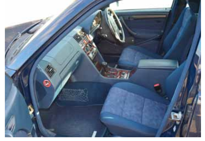
4 Hobbs Parker Classic Car Auction - Friday 2nd November 2018