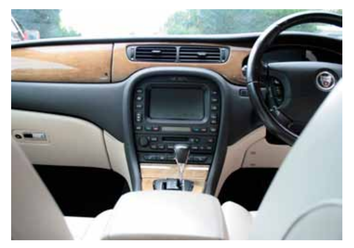
38 Hobbs Parker Classic Car Auction - Friday 2nd November 2018

• Paramount tuned from new • Jaguar serviced at 8k, 18k, 29k and 35k followed by specialists at 46k and two further Jaguar main dealer stamps at 53k and 62k in July 2016 • First registered in 2002 • MOT until 06/08/2019