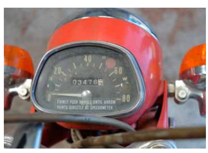
LOT 941 1965 Honda CI10 Sports Cub HPH 12C Guide: £2,500-£3,500