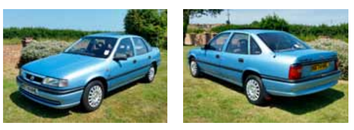
LOT 984 • 1993 Vauxhall Cavalier LS K674 HHL Guide: £800-£1,200