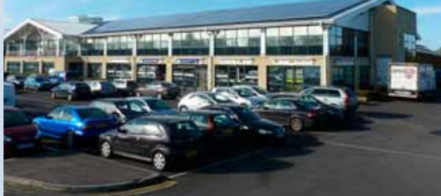
Established in 1850 we are Kent's largest independent firm of Auctioneers, Valuers & Estate Agents.