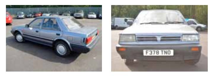
LOT 972 • 1989 Nissan Bluebird LX F378 TNO NO RESERVE

• Saloon • 4 Door • Blue • Petrol • Manual