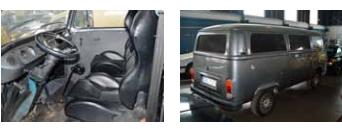
LOT 992 • 1979 VW T2 Transporter Guide: £3,500-£4,500