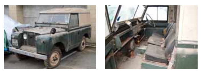
LOT 941 • 1965 Land Rover 88" 4 CYL FYC 203C Guide: £1,500-£2,000

4 x 4 • Green • Petrol • Manual • 72,672 miles (odometer reading) • Restoration project • Entered by it's local owner who has owned it since1990 • First registered 1965