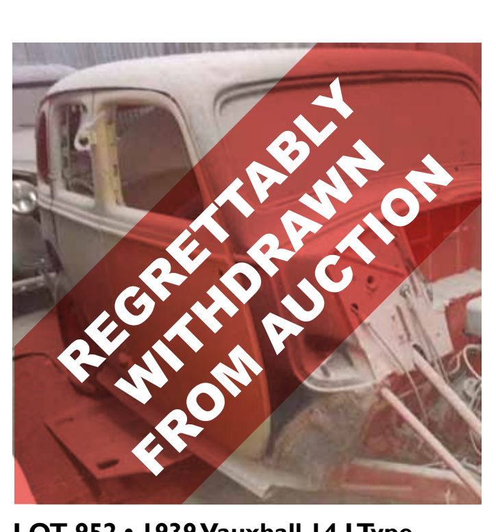
LOT 952 • 1939 Vauxhall 14 J Type BCJ 483 Guide: £TBA