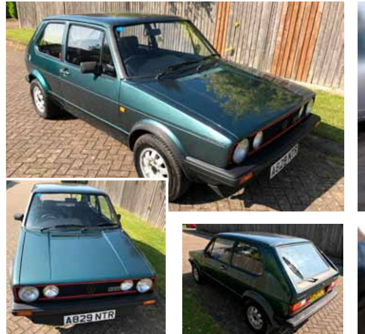
Lot 920 • 1983 Volkswagen Golf GTI A289 NTR Guide: £6,500-£7,500