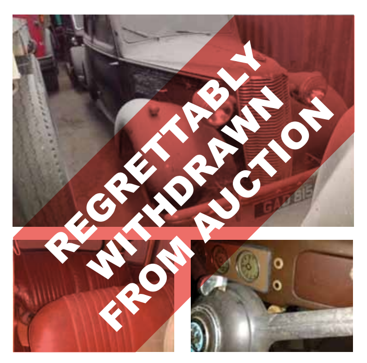
LOT 967 • 1946 Vauxhall 14 J Type GAD 815 Guide: £TBA