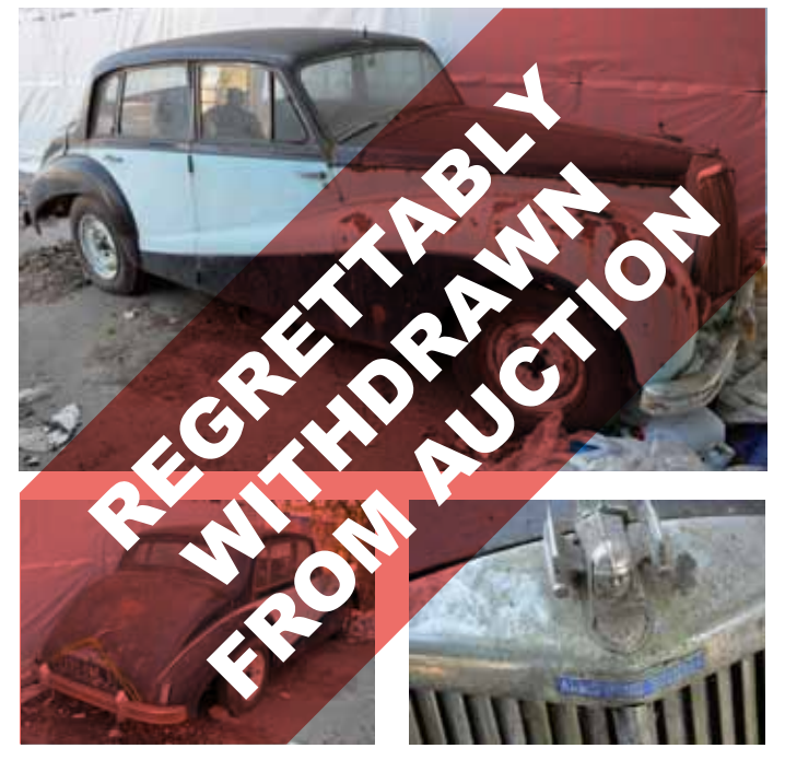
LOT 960 • Armstrong Siddeley Sapphire 195 BML Guide:TBA

Diesel • Pick-up • Red • Diesel • Manual • 2446cc 69,950 miles (odometer reading) • Entered by its registered keeper • Two owners from new, current owner since 1996 • First registered in 1992 MOT until 30/06/2019