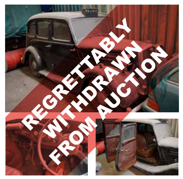
LOT 943 • Wolseley 12 SB5 436