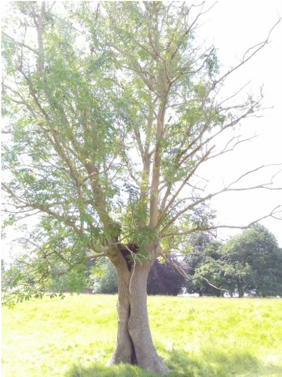
T71 viewed from the north