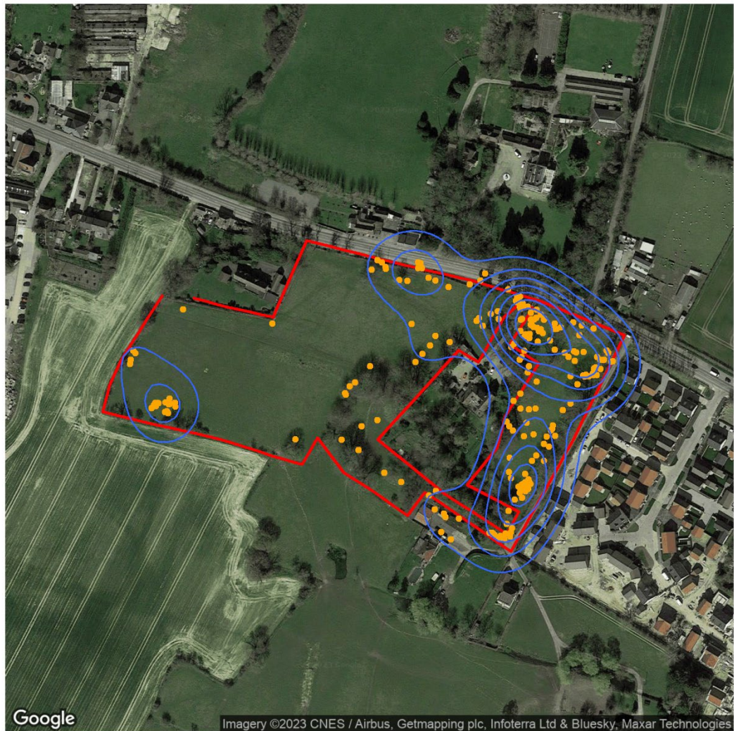
Figure 1. Indicative 'Utilisation Distribution' (UD) of all bat species/genera at the Site estimated from all transect data combined. Data was collected in July, August and September 2022. The UD illustrates the relative probability of a bat in flight being present at a given point at the Site, with higher/central contours having a greater probability, and lower/peripheral contours having less probability.