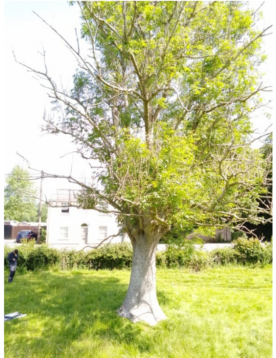
T71 viewed from the south