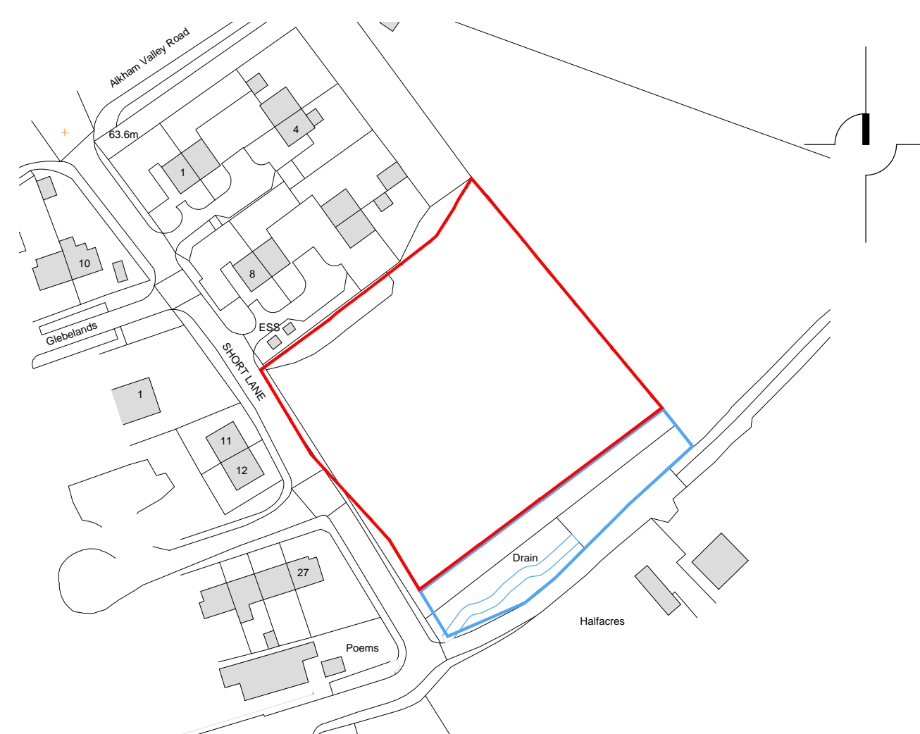
Location Plan (Scale 1:1250)