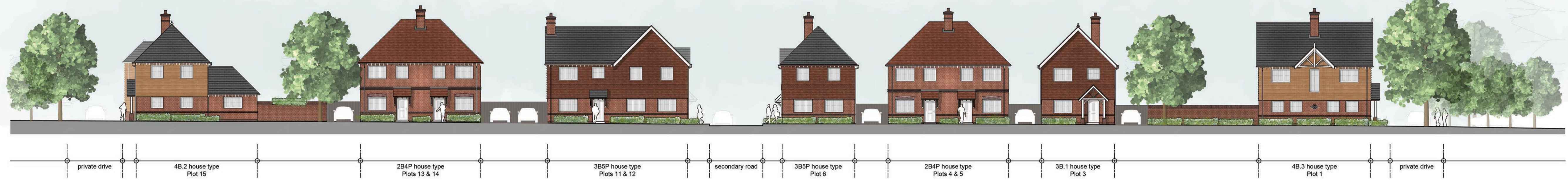
street scene a-a Scale 1:200 @ A1

revision: details: by: date: p1 first issue tw 17.10.25 a planning issue tw 22.10.25 b title block updated TW 19.11.25