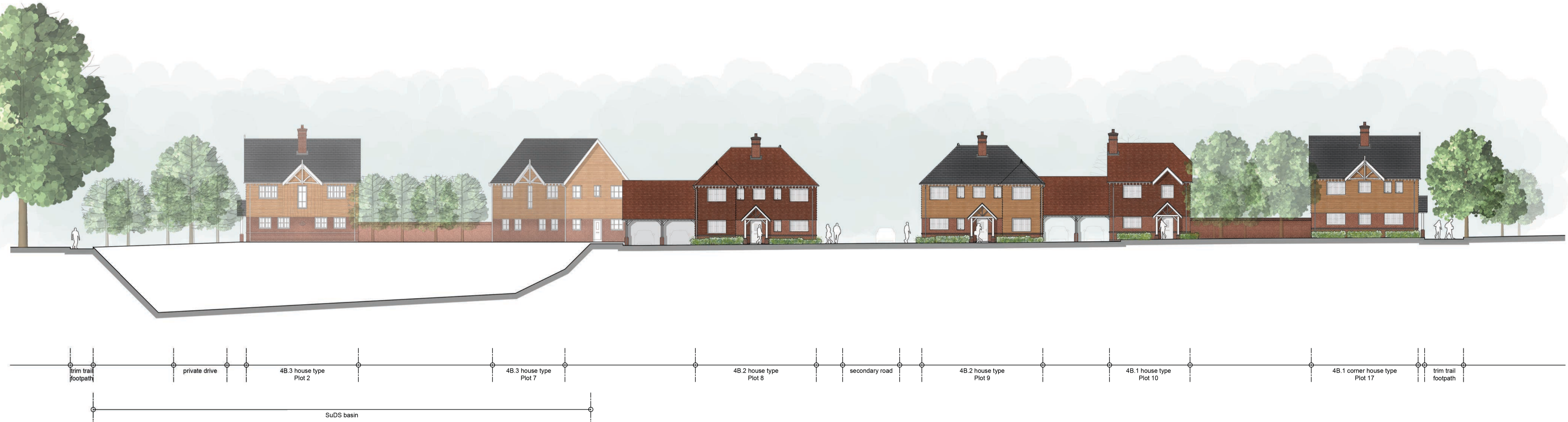
street scene b-b Scale 1:200 @ A1