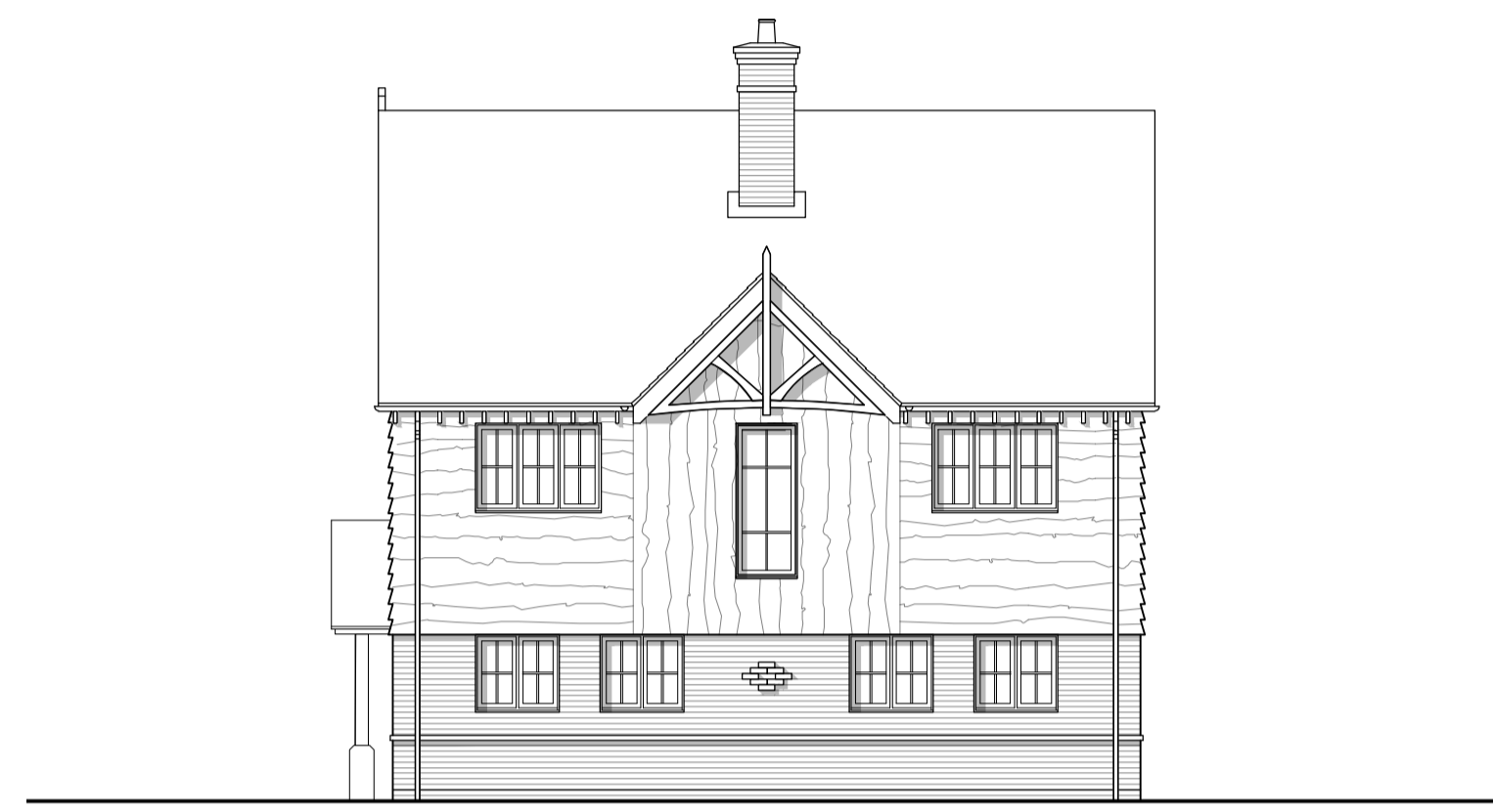
side elevation 01