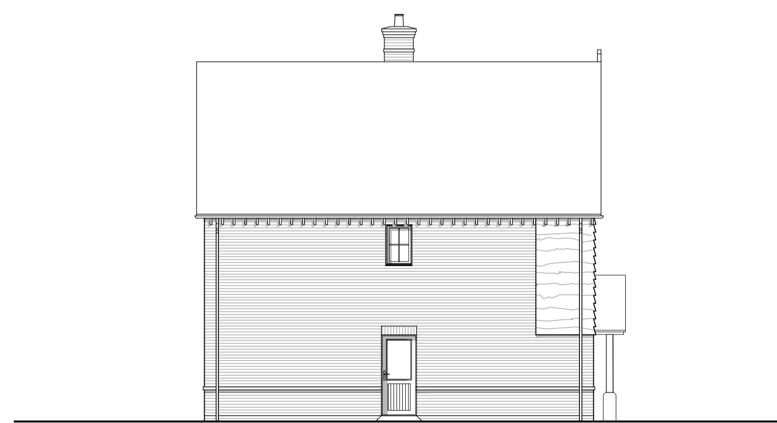
side elevation 02