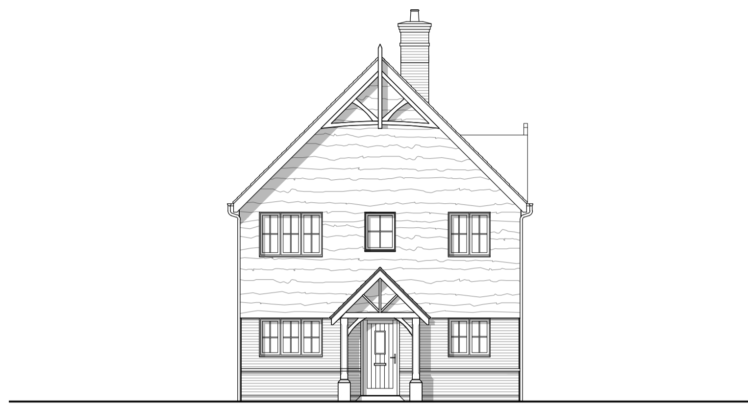
front elevation plots: 1, 2, 7

revision: details: by: date: a planning issue fw 22.10.25 b title block updated TW 19.11.25