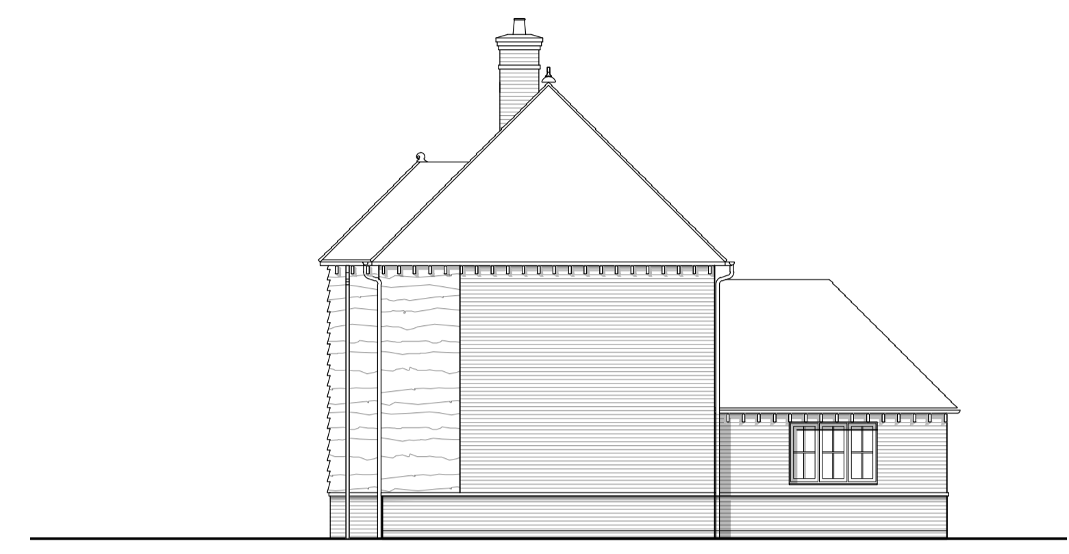
side elevation 01