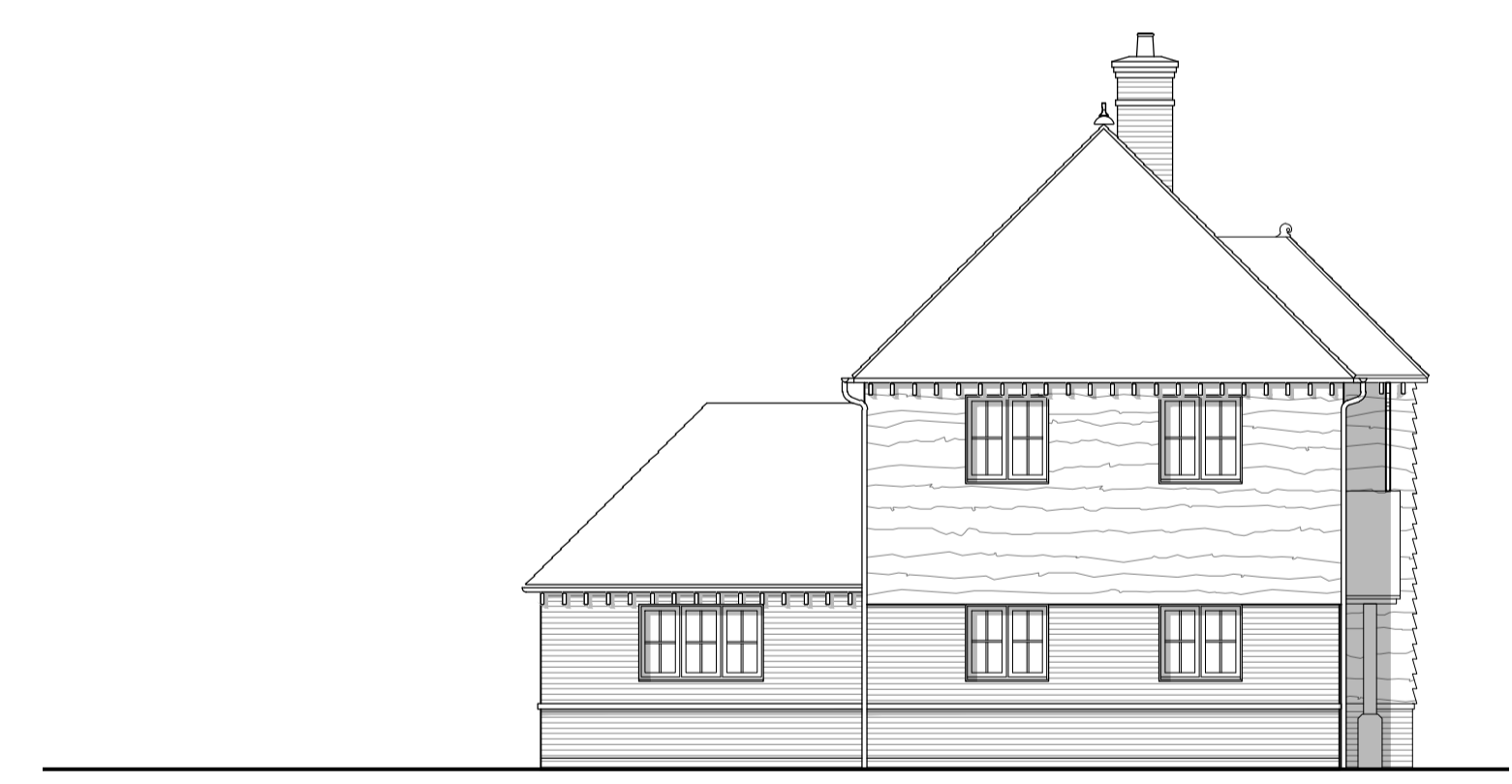
side elevation 02