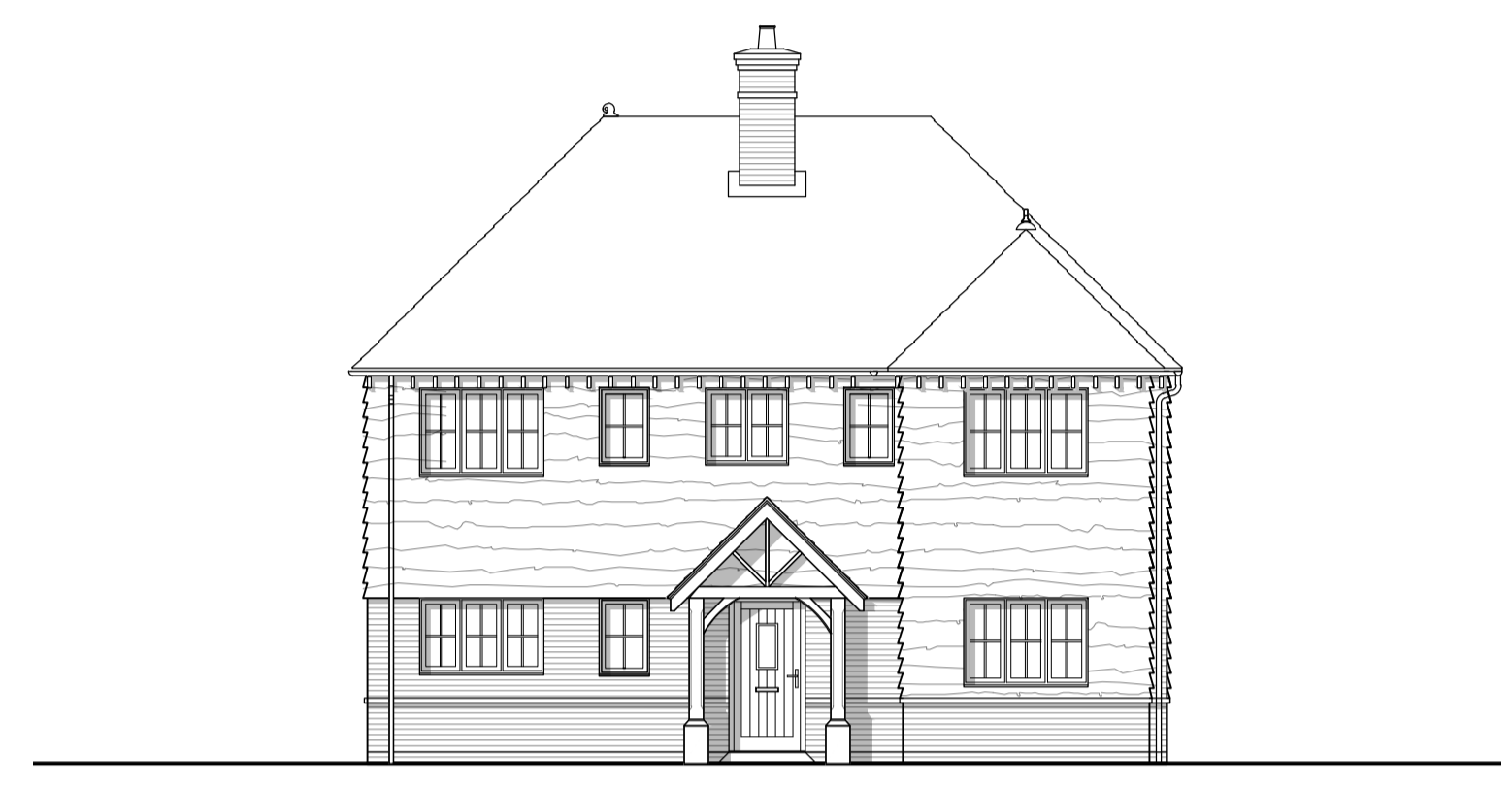
front elevation plots: 9, 15

revision: details: by: date: a planning issue tw 22.10.25 b title block updated TW 19.11.25