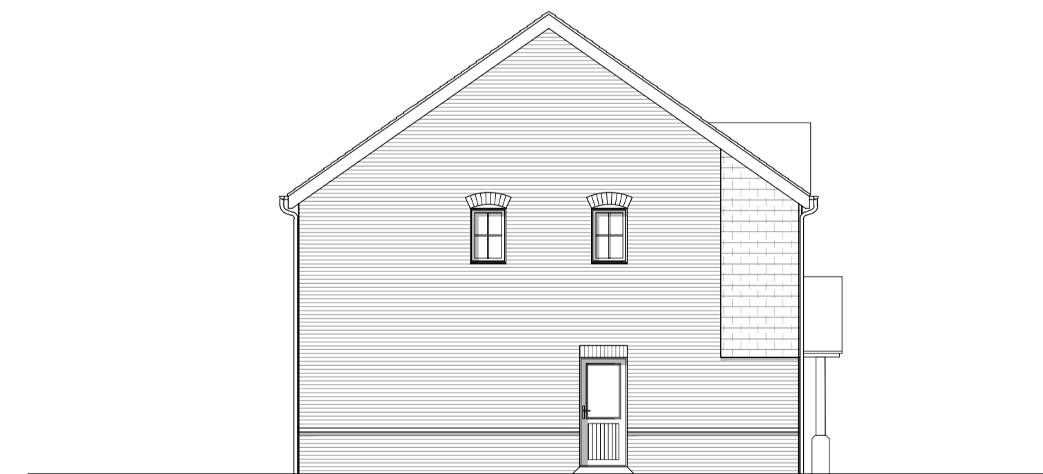
side elevation 02