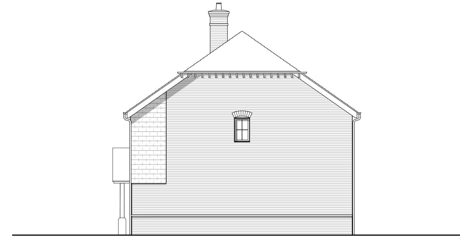
side elevation 01