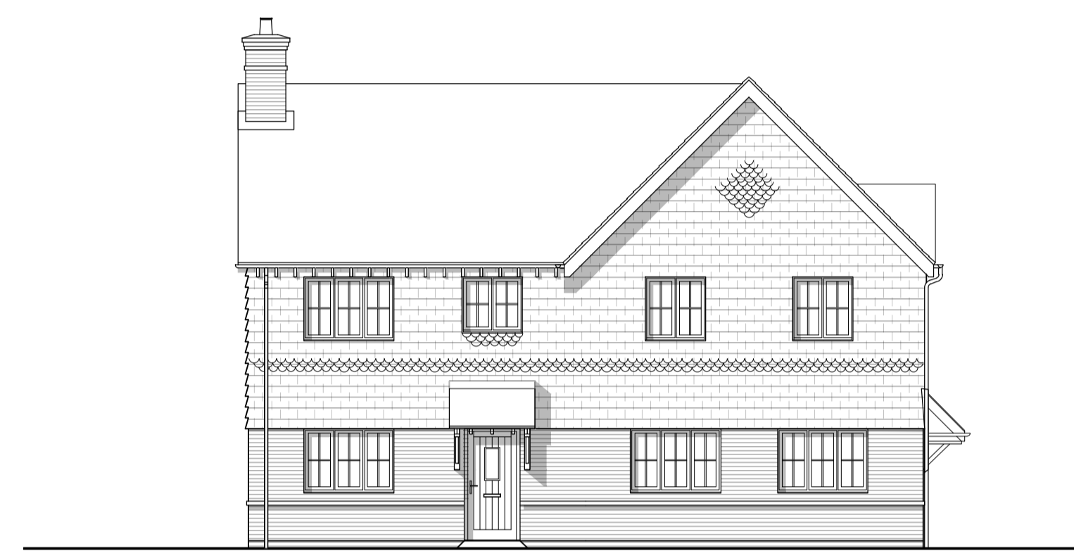
front elevation plots: 11 & 12