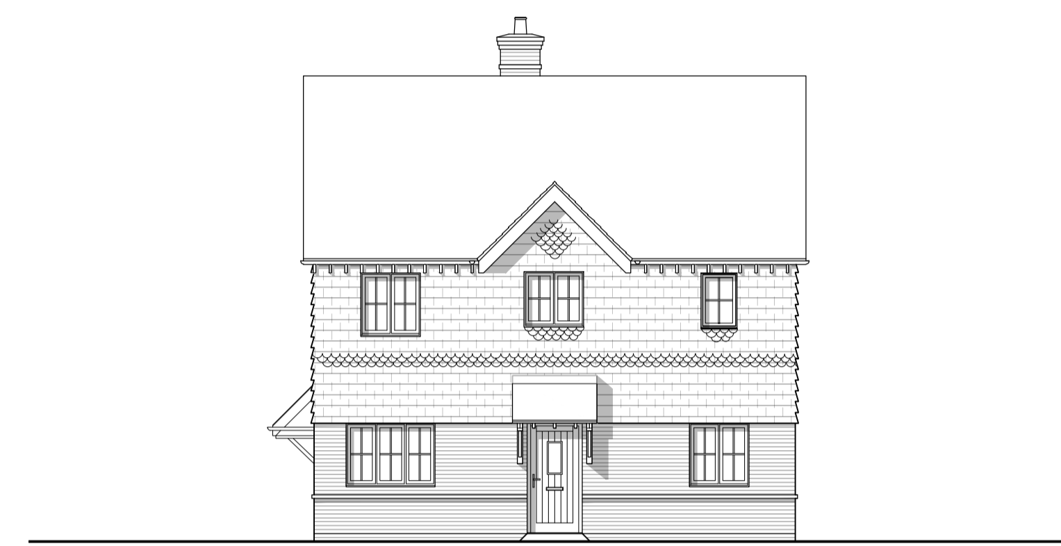
side elevation 01