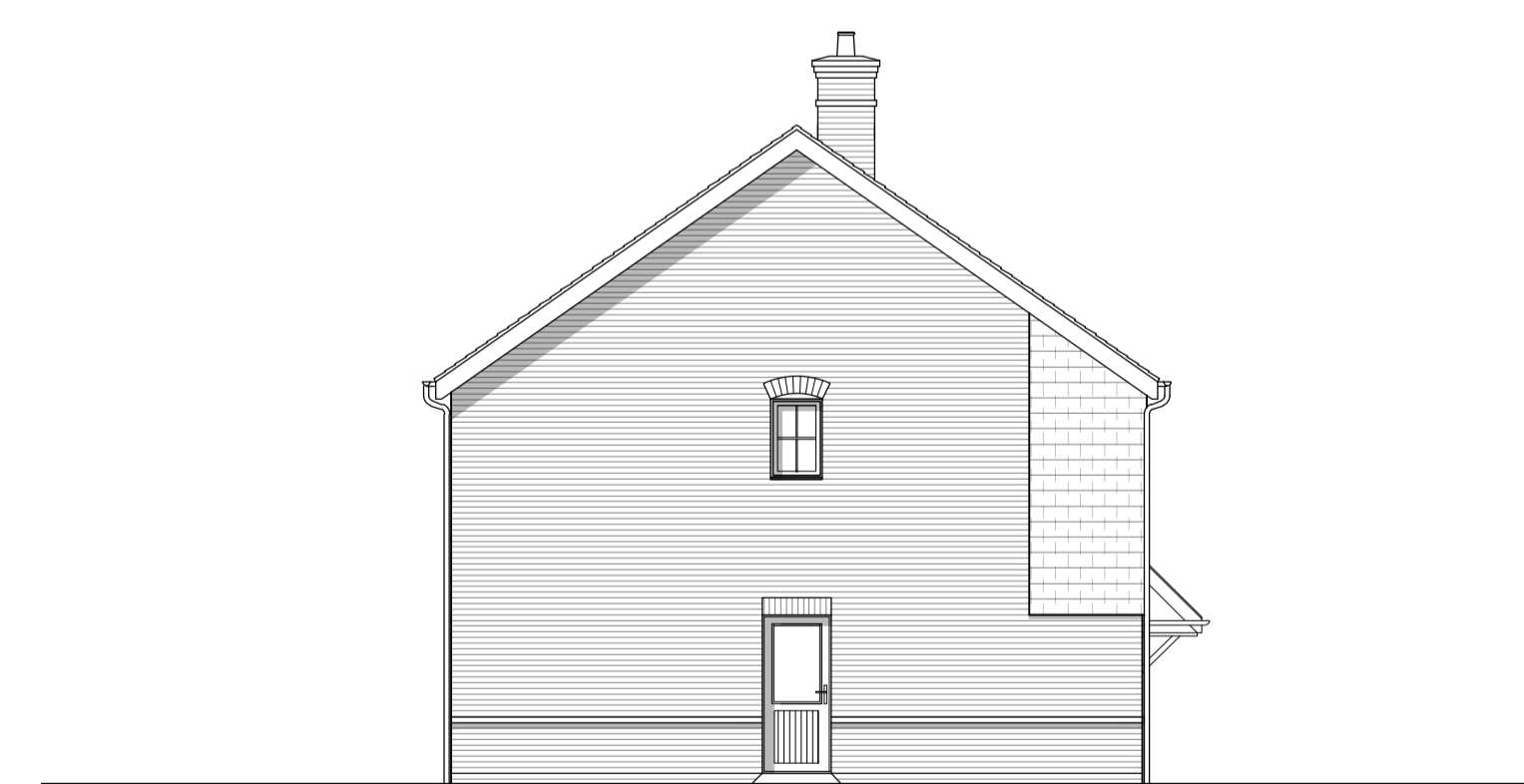
side elevation 02

house type - 3b5p semi-detached Scale 1:100 @ A1