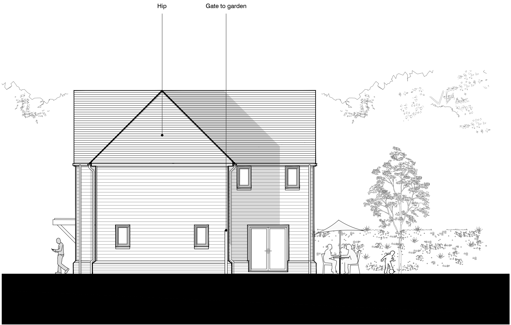
West Facing Elevation 1:100 @ A1