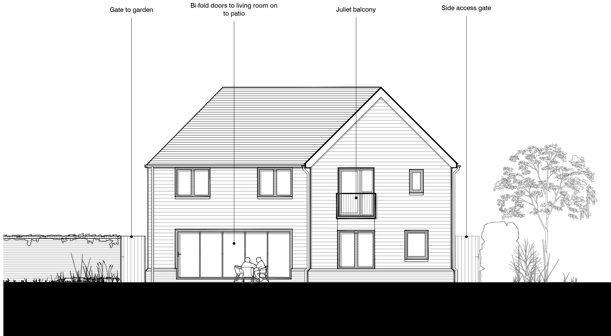
South Facing Elevation 1:100 @ A1