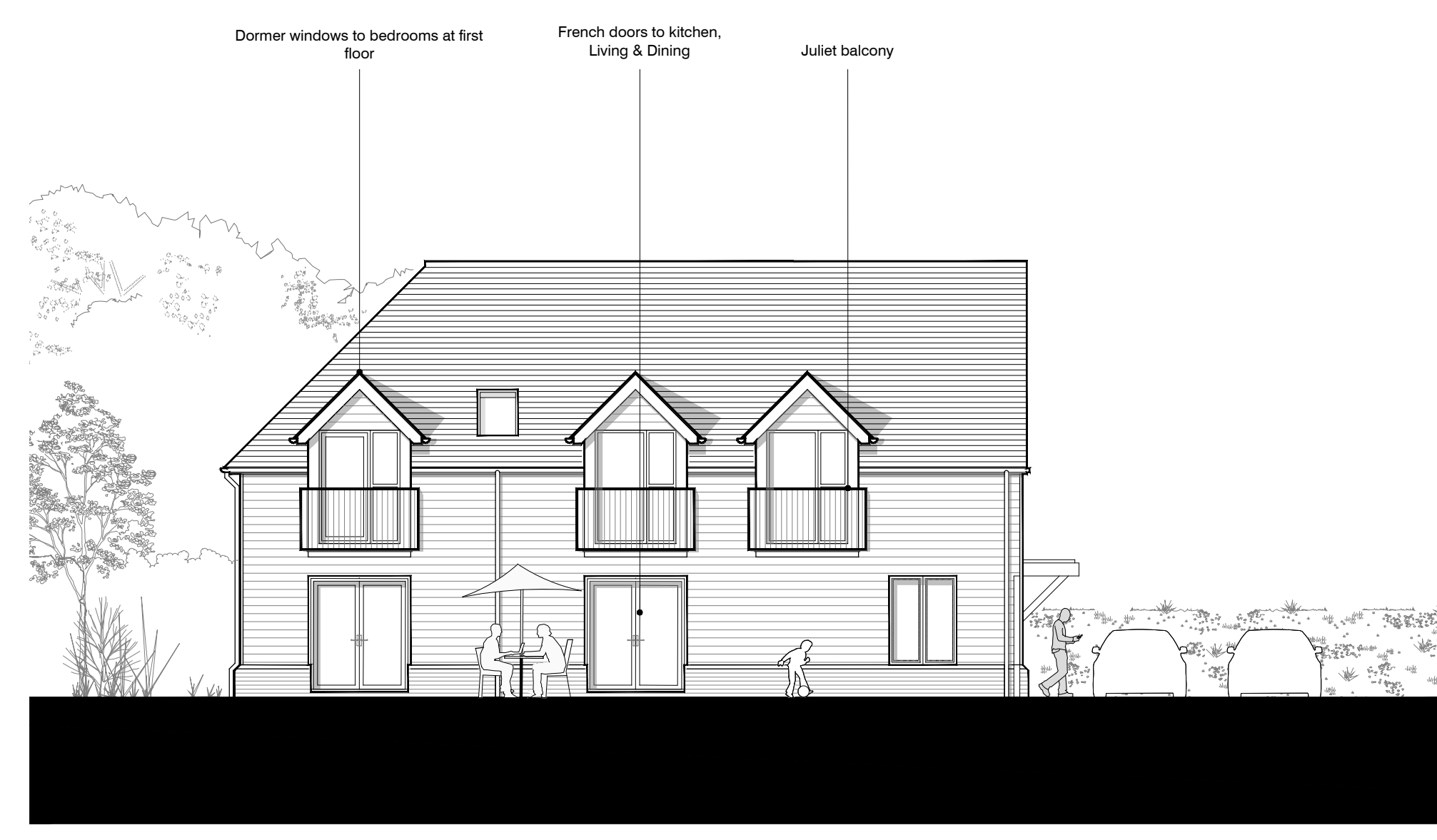
South Facing Elevation 1:100 @ A1