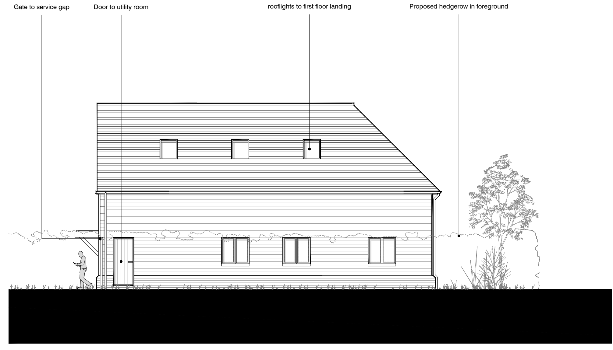
North Facing Elevation 1:100 @ A1