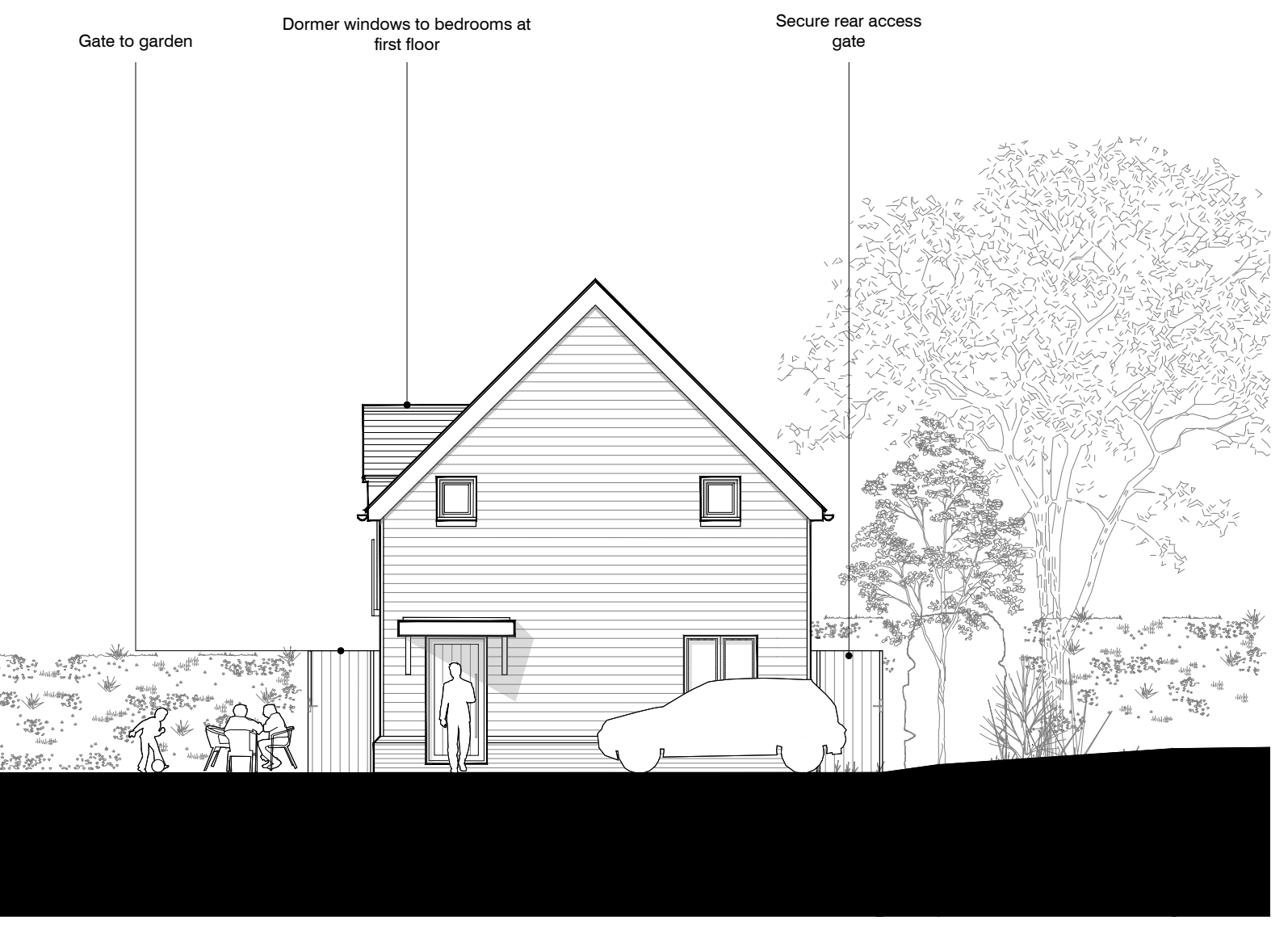
East Facing Elevation 1:100 @ A1