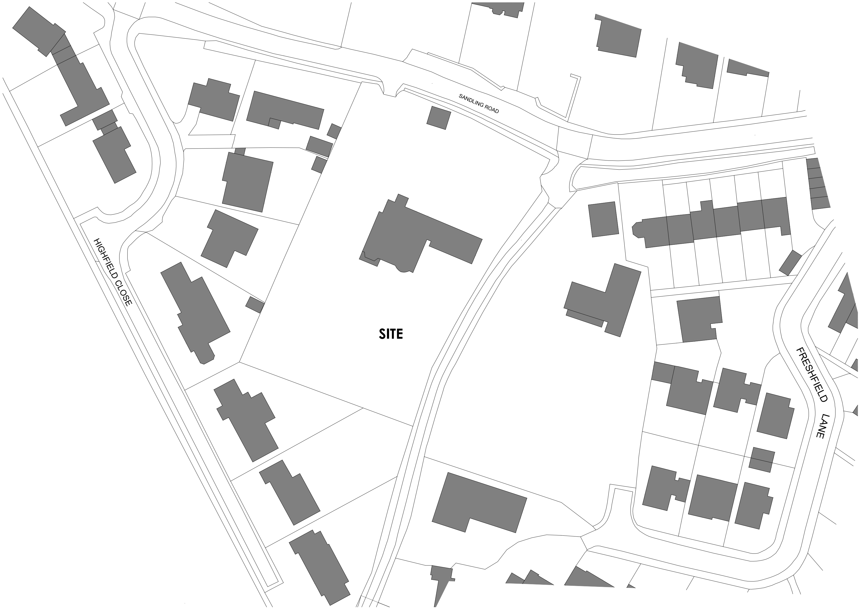
EXISTING BLOCK PLAN 1:500 @ A1 Ordnance Survey, (c) Crown Copyright 2022. All rights reserved. Licence number 100022432