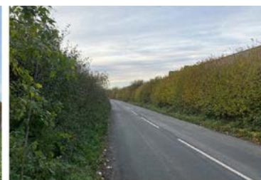
Viewpoint 3: Existing View from Old Ashford Road