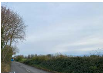
Viewpoint 1: Existing View from Old Ashford Road