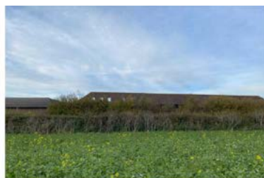
Viewpoint 2: Existing View from within site towards Old Ashford Road