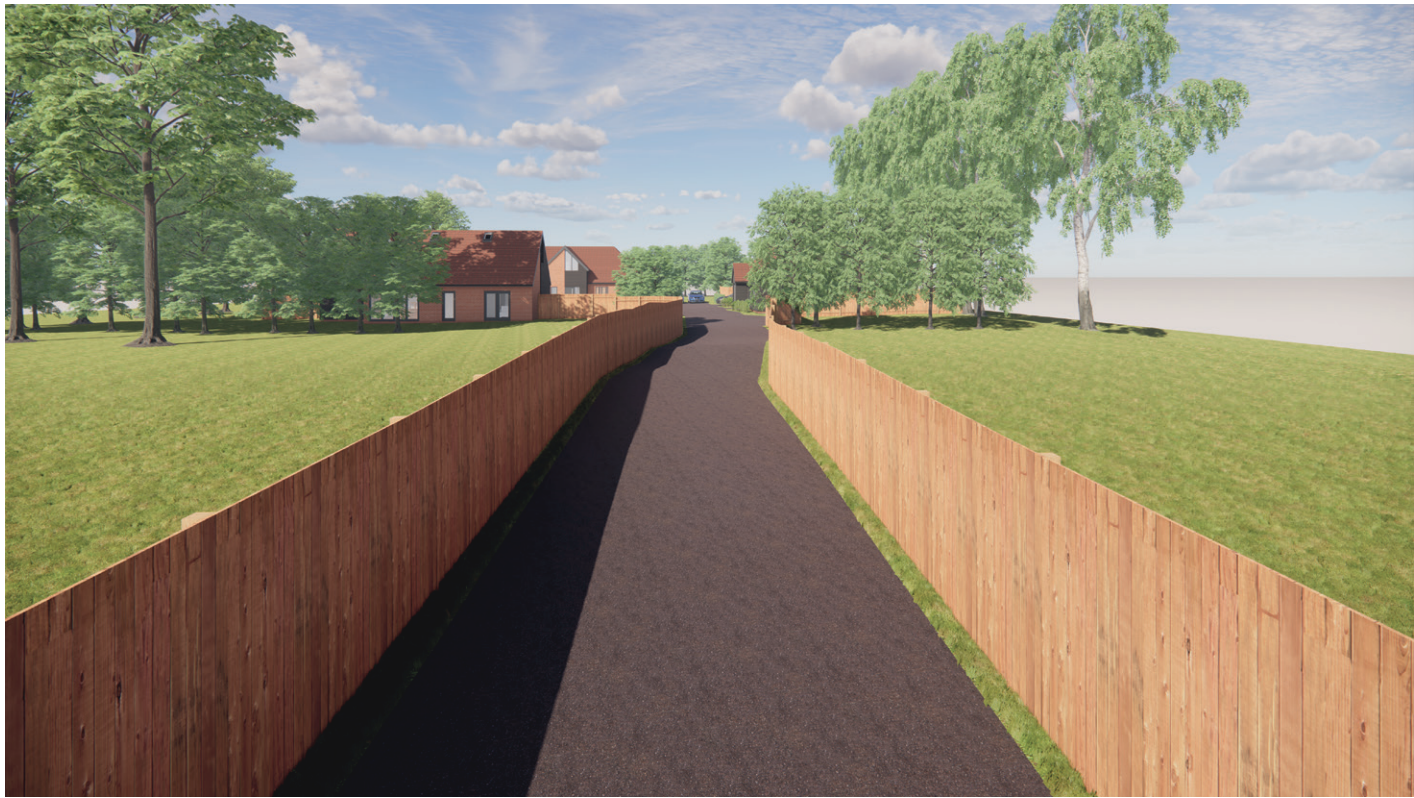
3D Perspective of the Site Entrance