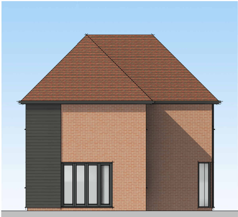
Side Elevation 1 : 100