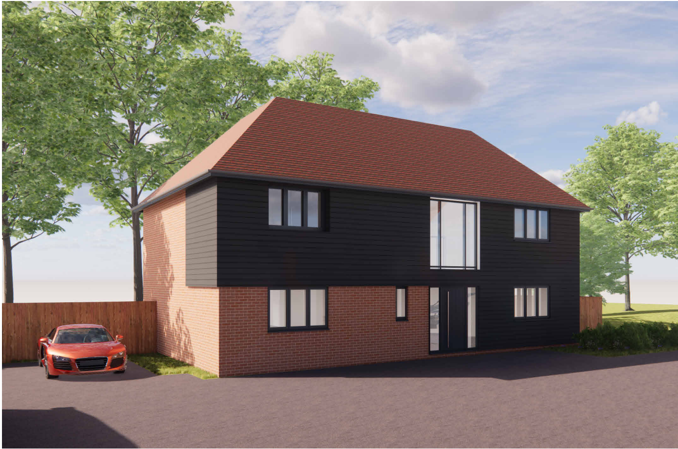
Proposed 3D Perspective