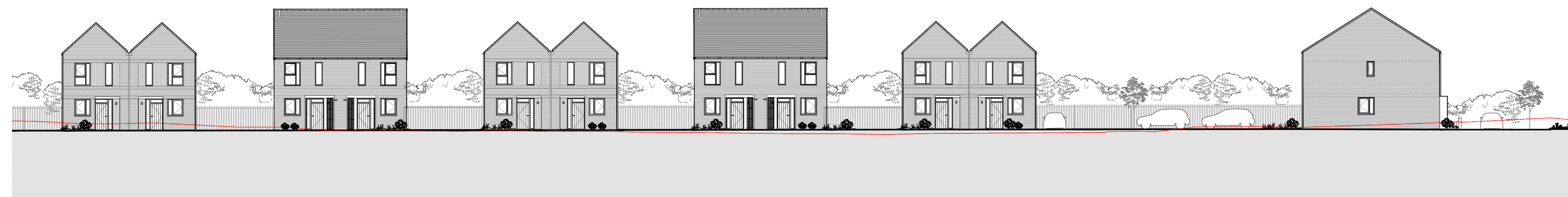
PROPOSED SITE SECTION F-F SCALE 1:200 @ A0