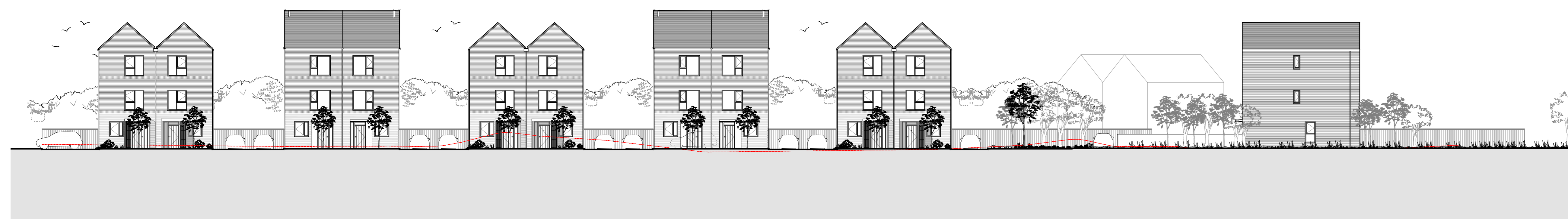
PROPOSED SITE SECTION G-G SCALE 1:200 @ A0