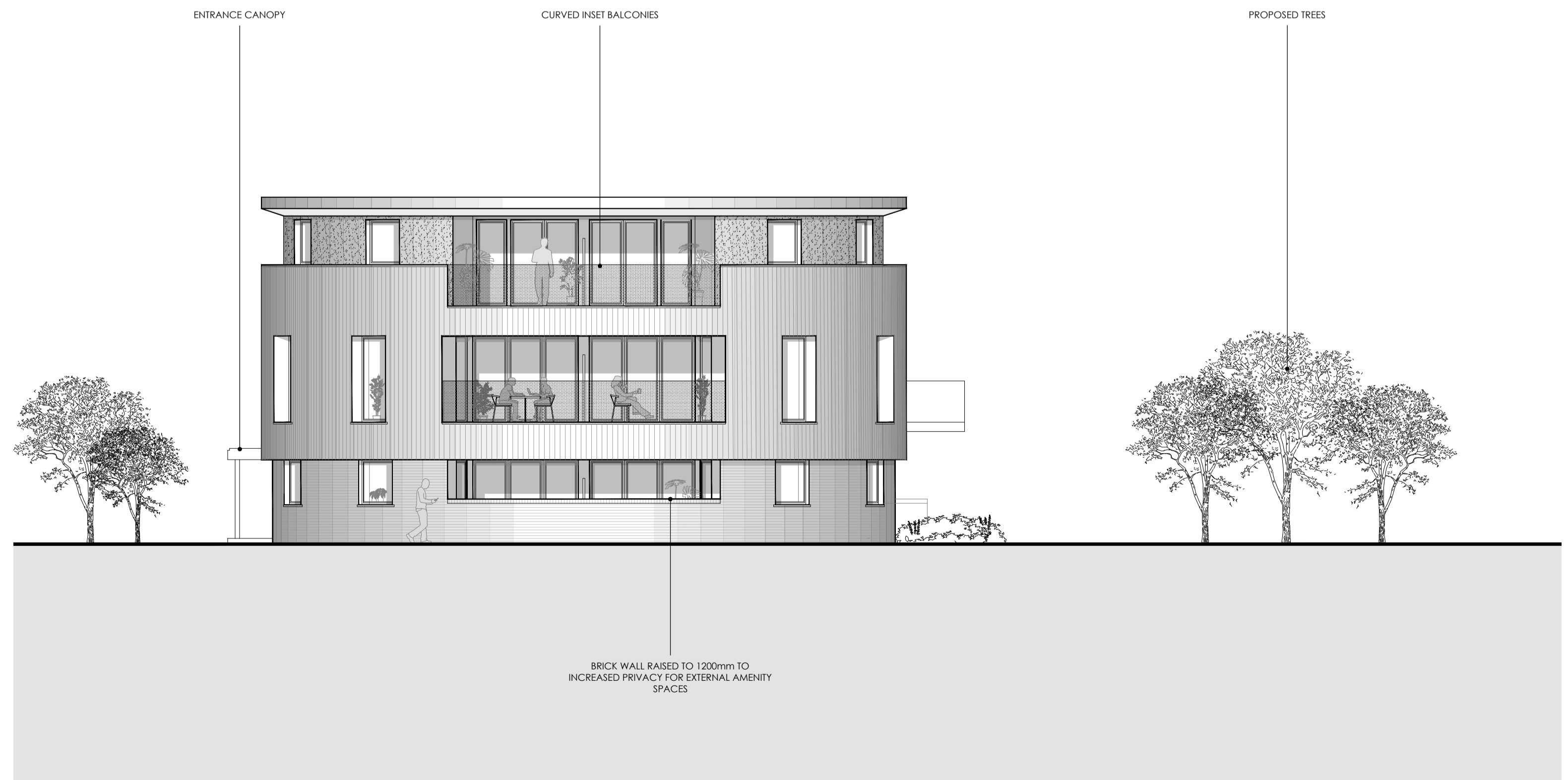
PROPOSED ELEVATION C-C SCALE 1:100 @ A1