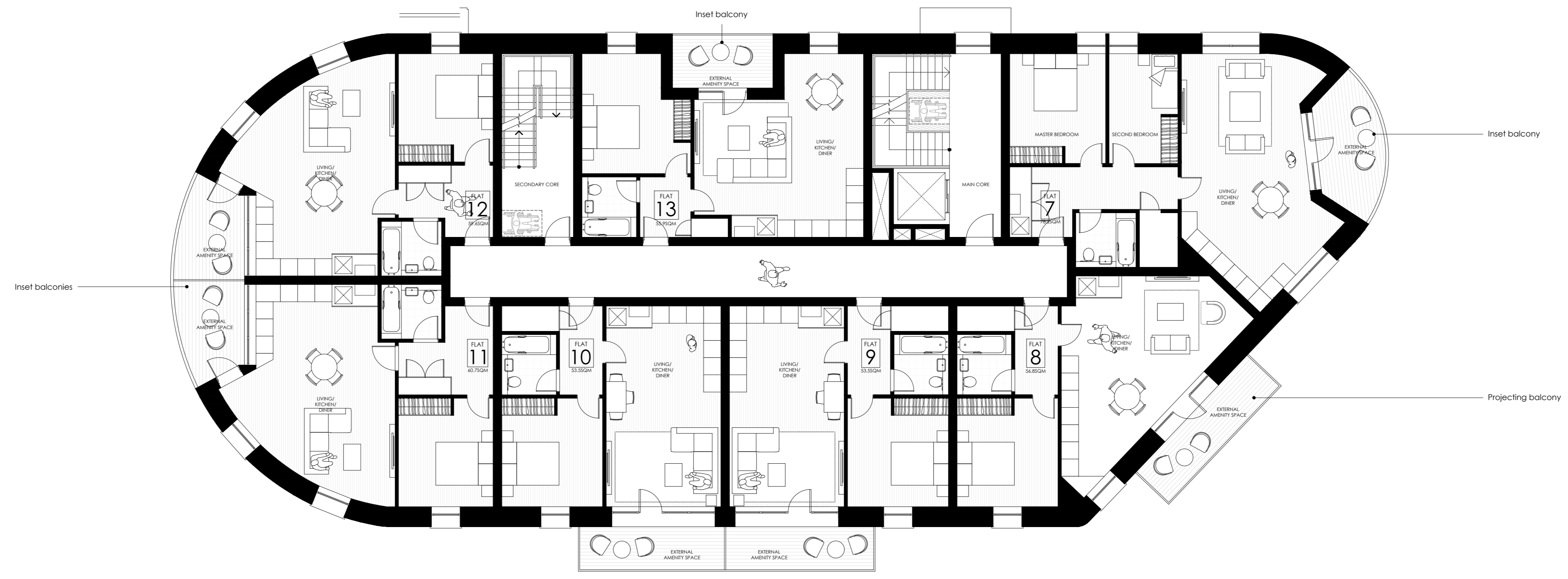
PROPOSED FIRST FLOOR PLAN SCALE 1:100 @ A0