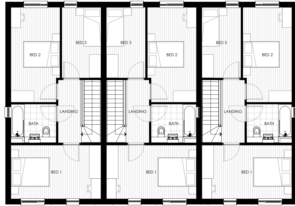
PROPOSED FIRST FLOOR PLAN SCALE 1:100