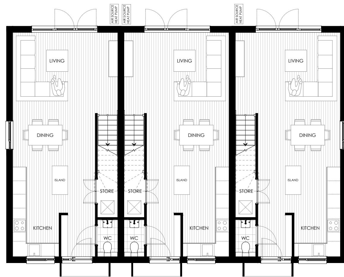
PROPOSED GROUND FLOOR PLAN SCALE 1:100