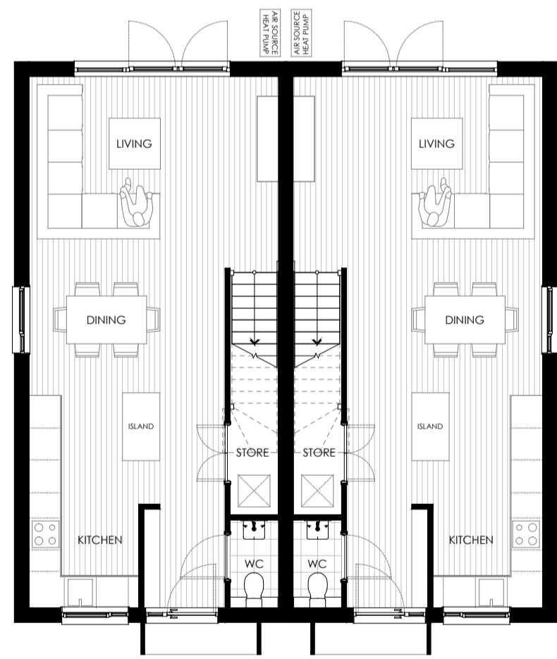
PROPOSED GROUND FLOOR PLAN SCALE 1:100