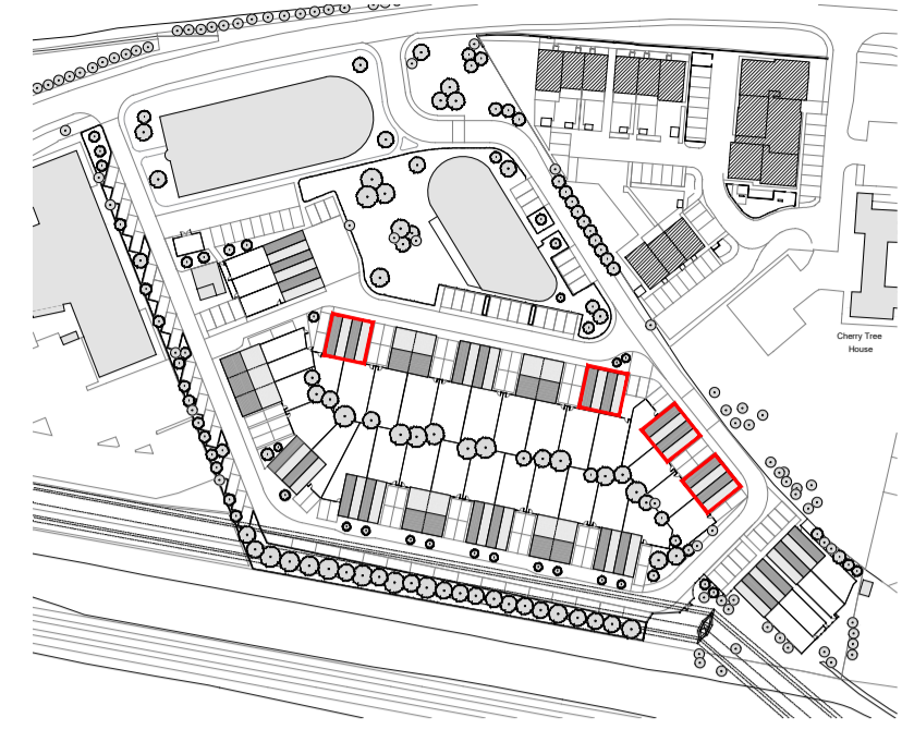
KEY PLAN N.T.S.