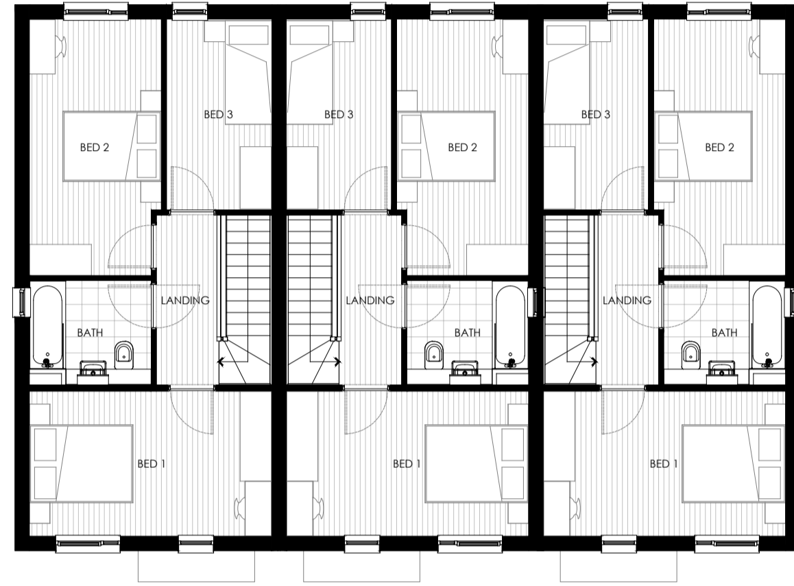
PROPOSED FIRST FLOOR PLAN SCALE 1:100