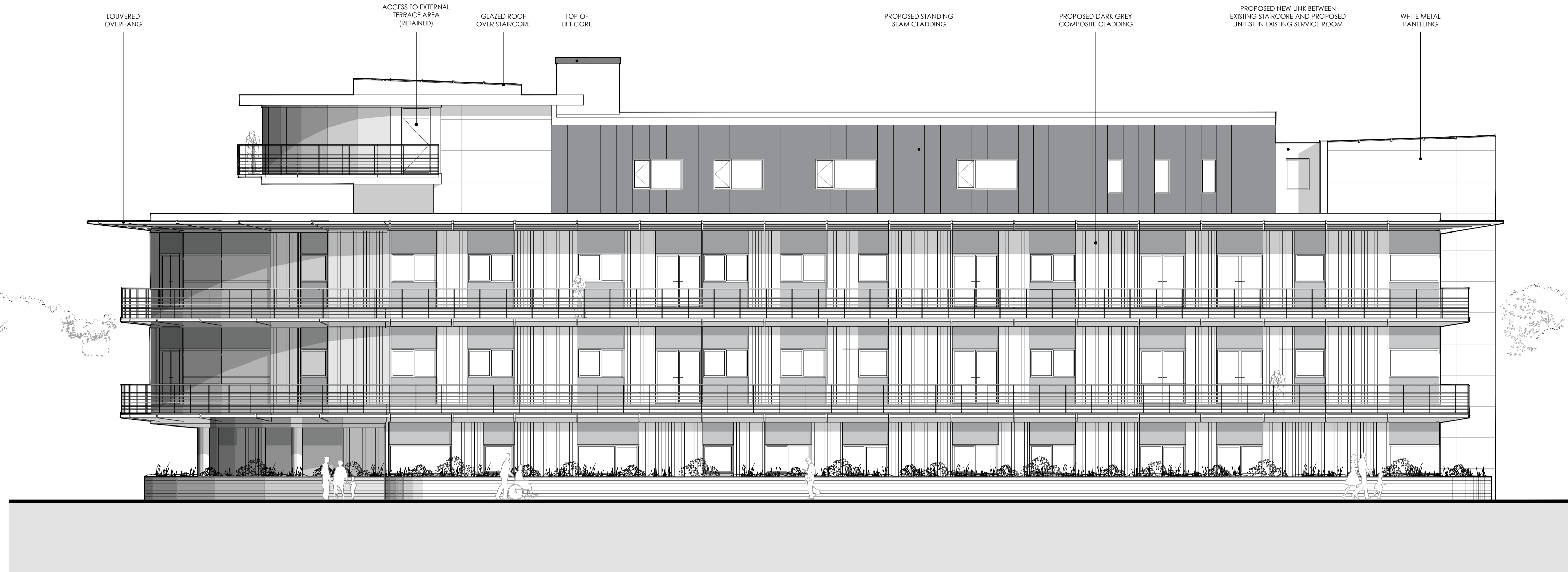
PROPOSED ELEVATION B-B SCALE 1:100 @ A1