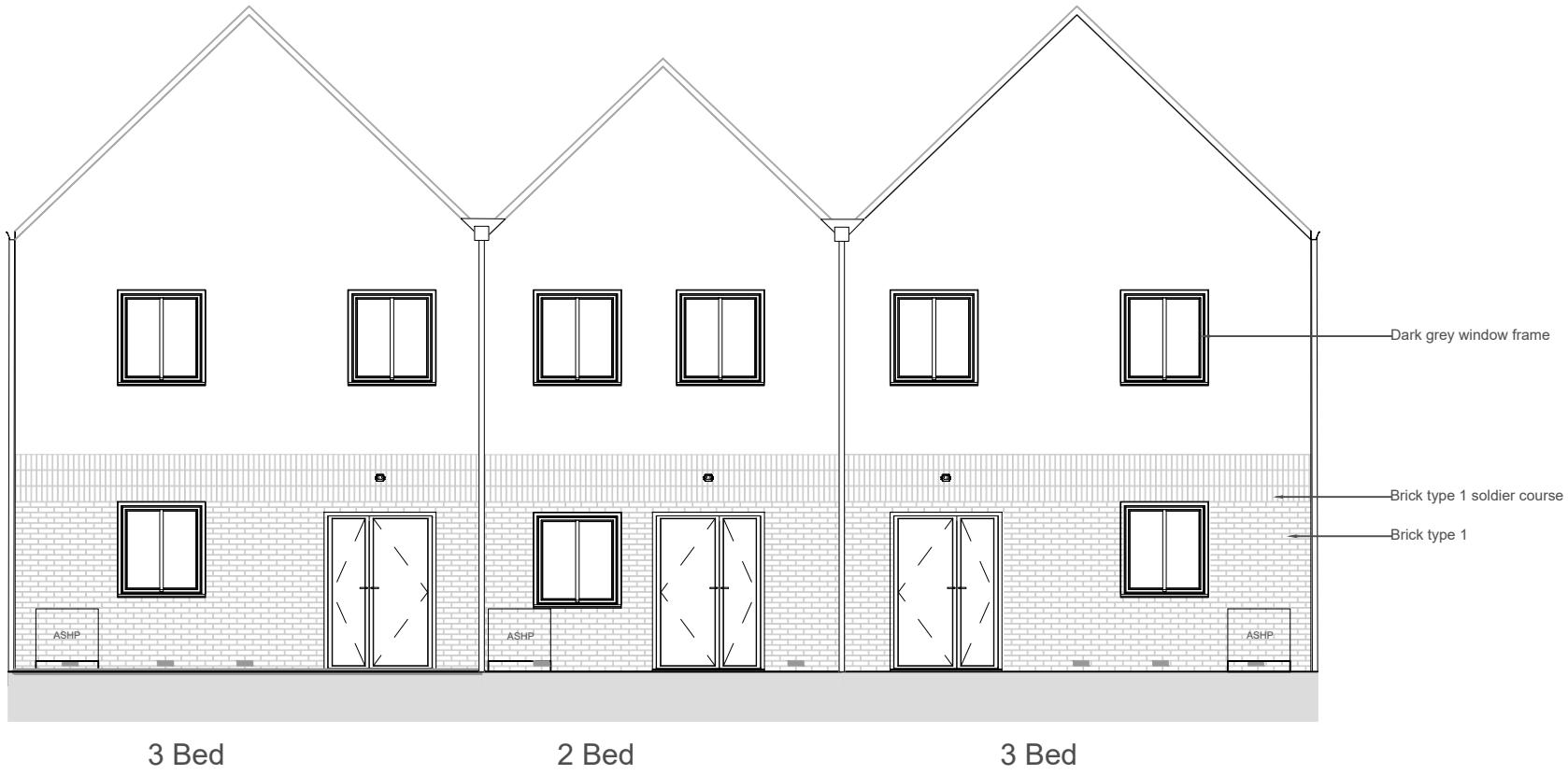
3 Bed 2 Bed 3 Bed Rear Elevation 1:100