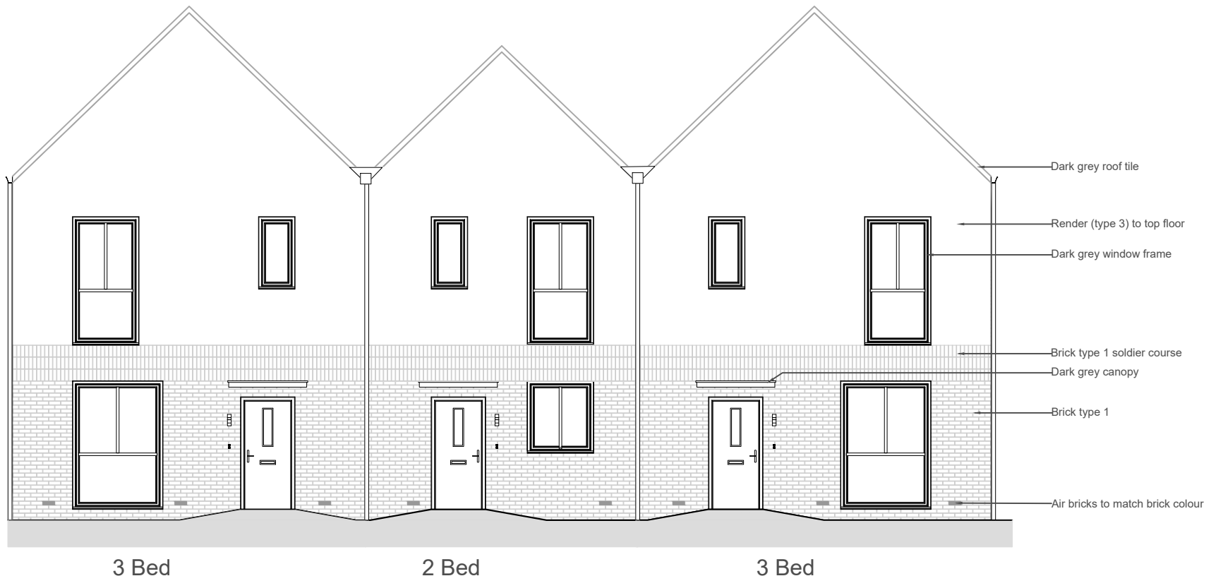
3 Bed Front Elevation 1:100