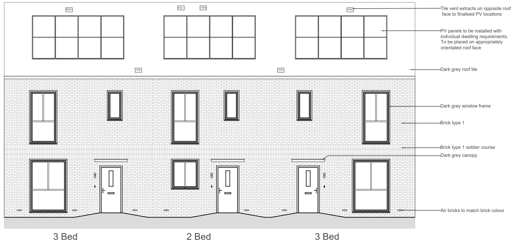
Front Elevation 1:100