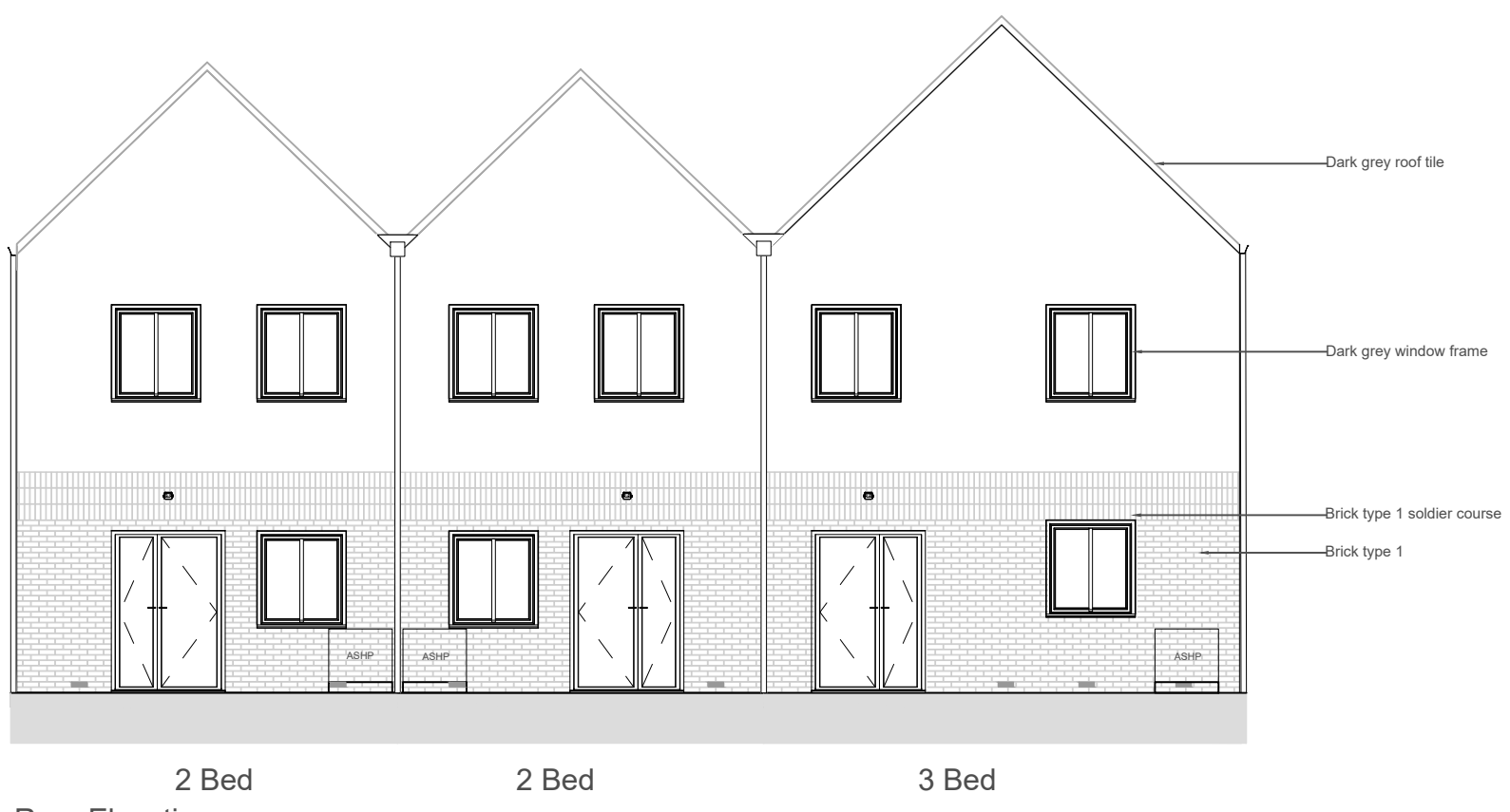
Rear Elevation 1:100