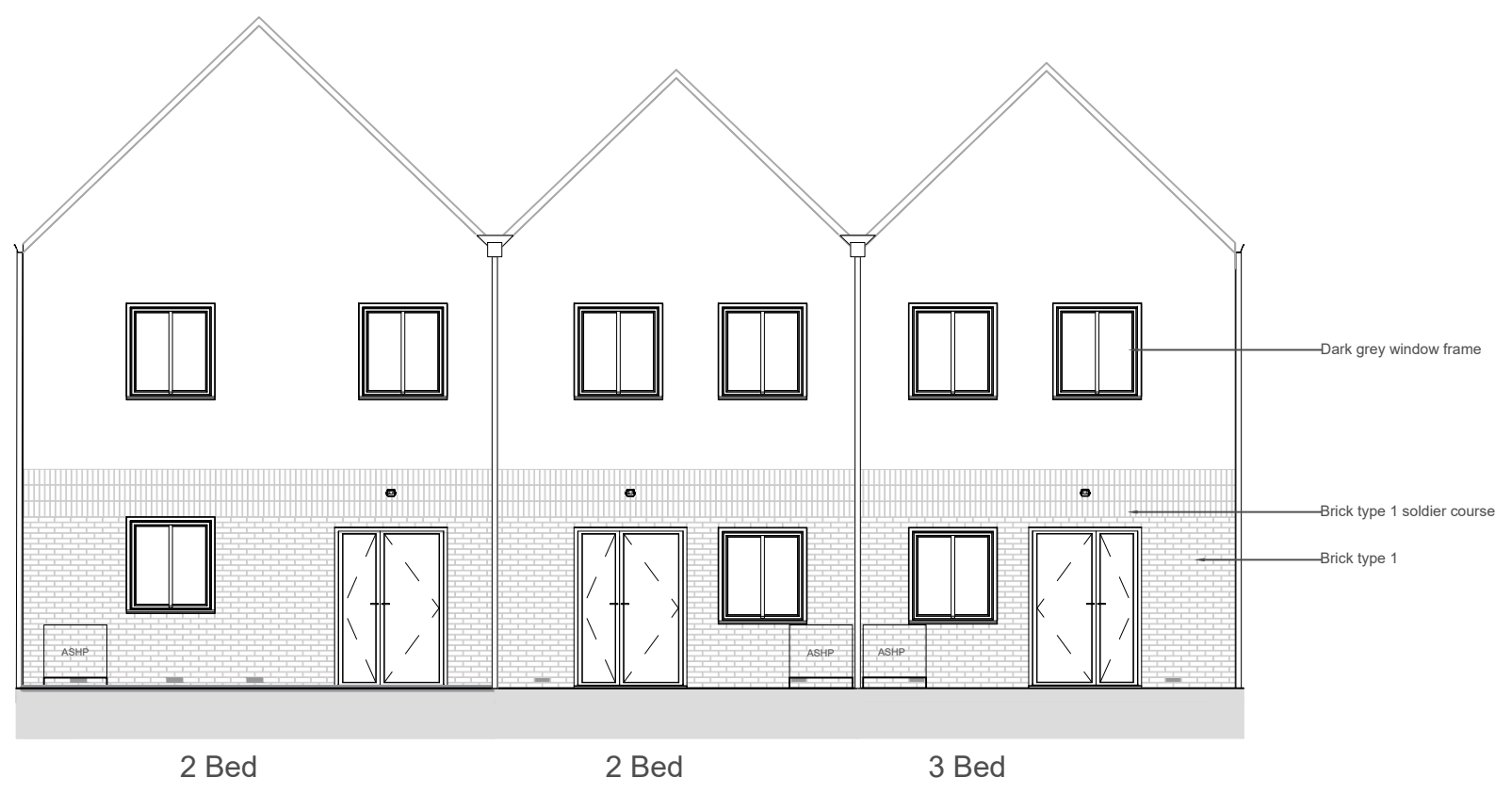
Rear Elevation 1:100