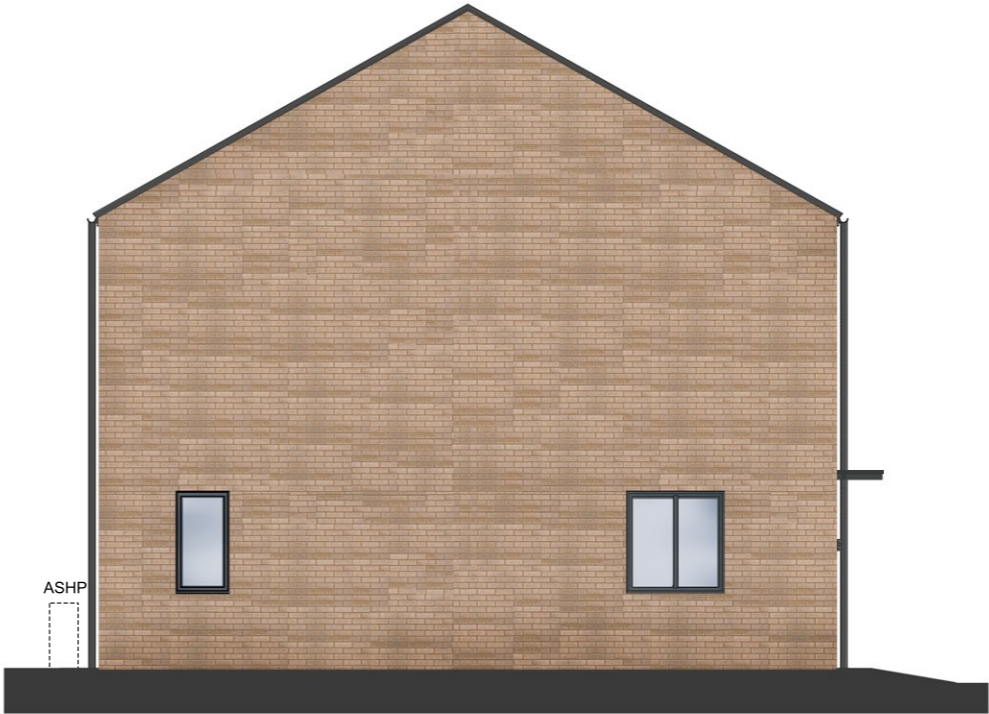
Gable Elevation (Left)