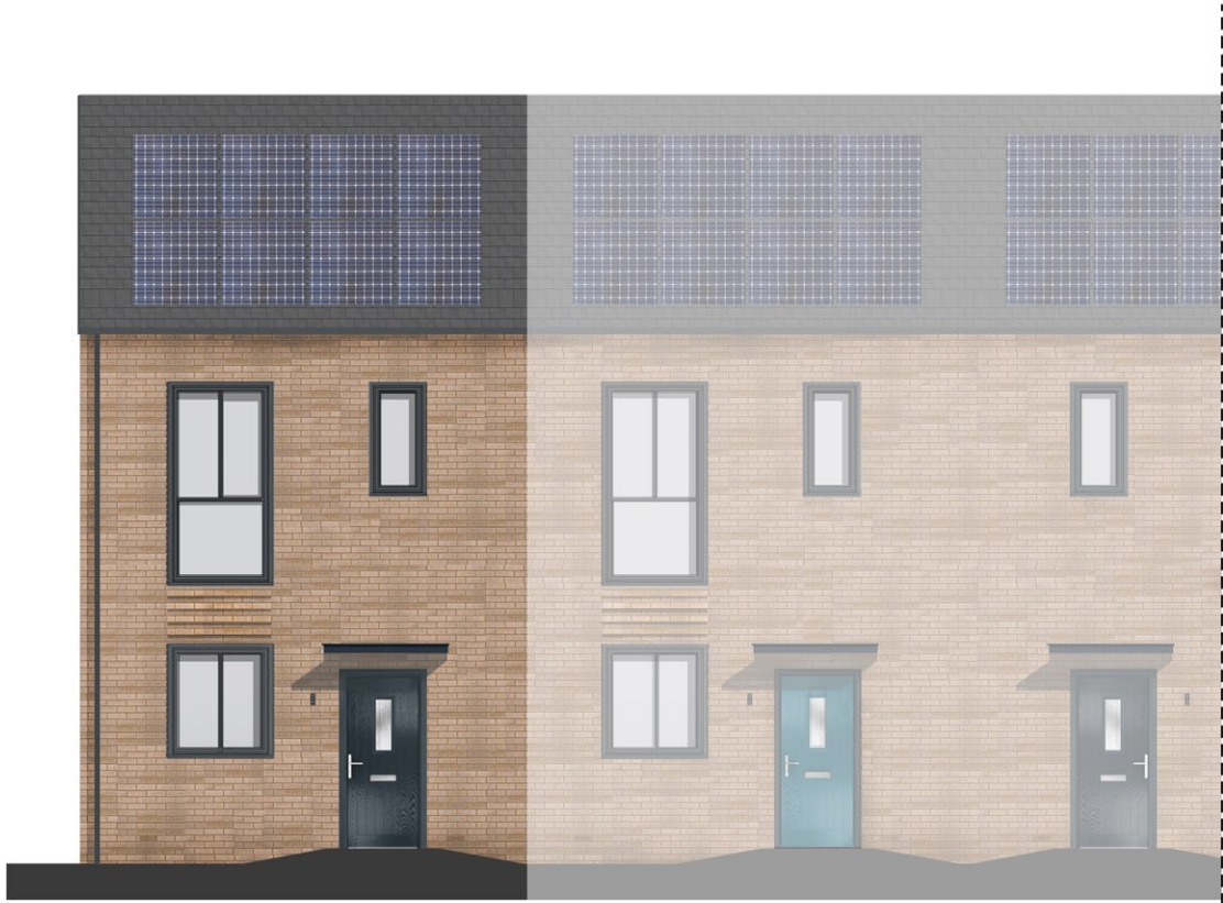
Front Elevation PV Panels shown indicatively