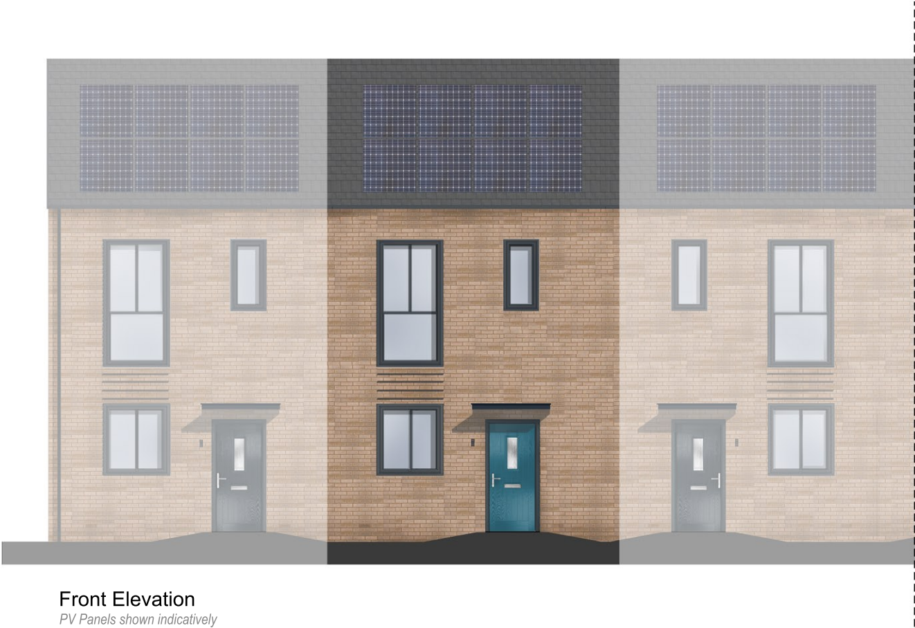
Front Elevation PV Panels shown indicatively