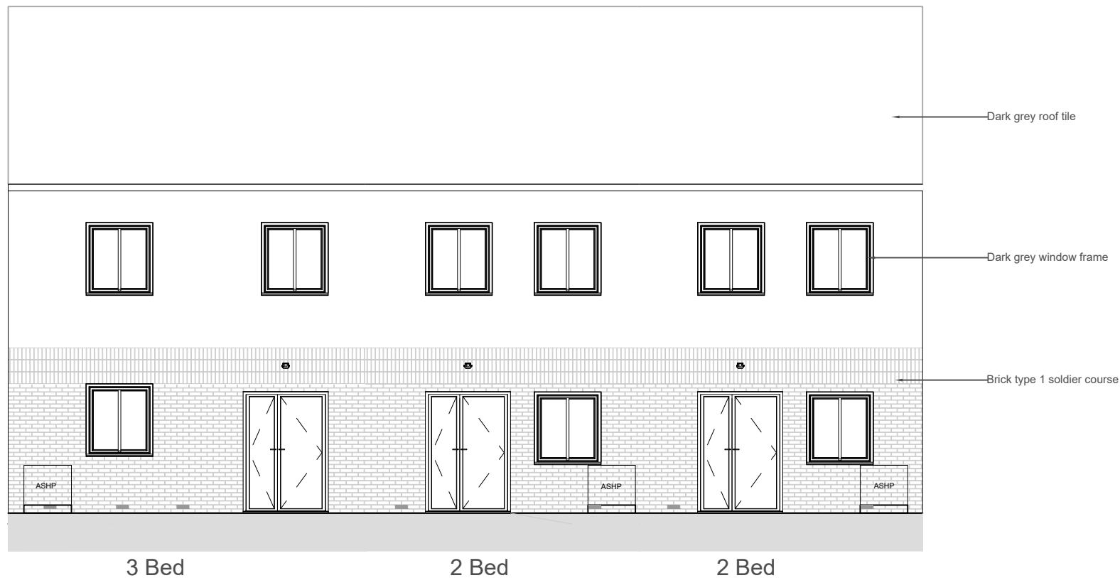
Rear Elevation 1:100